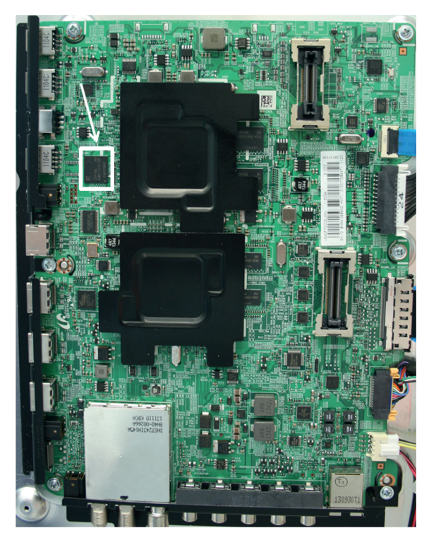
Fig. 1. Main board.

Fig. 1 depicts the main board of the Samsung Smart TV. The white square emphasises the location of the memory chip of the Smart TV.