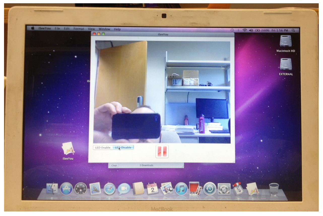
Fig. 3: iSeeYou running on a white MacBook "Core 2 Duo" capturing video from the internal iSight with the LED (the black dot to the right of the square camera at the top, center of the display bezel) unilluminated.

HID keyboard which, once loaded, performs the following actions in order: