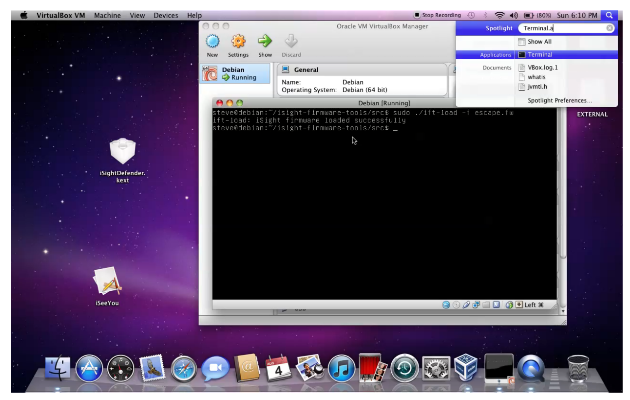
Fig. 4: Virtual machine escape. The iSight has been reprogrammed to act as a USB keyboard from inside a VirtualBox virtual machine and it is sending key presses to the host operating system. It is in the middle of entering "Terminal.app" into Spotlight.

user can interfere by performing an action such as typing or clicking the mouse. One way to partially compensate is to decrease the USB polling interval by changing the USB endpoint descriptors in the firmware allowing the iSight to send key presses more quickly.