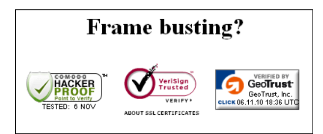
Figure 3.1.: Logos of the certification authorities Comodo, Verisign and Geotrust loaded by iframes displayed with the web browser Google Chrome 8.0 beta

A randomly selected test has shown, that providers of such logos have no frame busting mechanism on their web pages, on which their own logos are included. These logos can be used to show them in another context, as displayed in Figure 3.1. The HTML and CSS code used in Figure 3.1 is given in the appendix with the Listings A.4, A.5, A.6 and A.7.