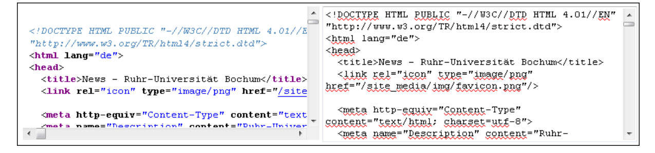
Figure 2.5.: Content extraction code of Listing 2.18 displayed with Mozilla Firefox 3.6.3

With the combination of a "textarea" tag, just two drags to perform this attack are needed, as in the case of elements like images. The first drag is to select an element and the second to drag an element out of the iframe into the text area. The element is, in the case of "view-source:", the source code of the web page. Listing 2.18 gives the discussed text area and iframe. The iframe loads the web page of the "Chair of network and data security". A screenshot of the created web page and a successful drag-and-drop operation is given in Figure 2.5.