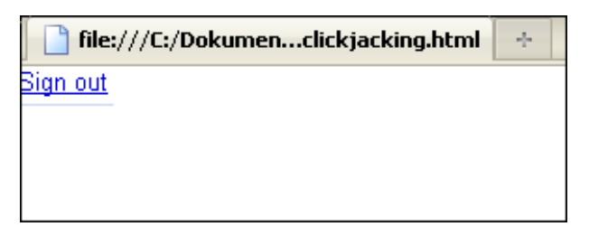
Figure 2.2.: Output of the file "clickjacking.html" interpreted by the web browser Mozilla Firefox 3.6.3

of Listing 2.2 and Listing 2.1 shows that there is a new attribute "id" inside the "iframe" tag. The attribute "id" holds the value "inner". This value is addressed by CSS <sup>3</sup> code given with the last three lines of Listing 2.2. With "#inner" is specified that the position of the element that holds the "id" value "inner" is absolute and that it should be moved 1,955 pixels to the left and 14 pixels up. Furthermore, there are new height and width specifications. These values are defined according to the layout of the web site and especially to the "Sign out" link. It should be noted that it may be an advantage to keep these values small to focus on the essential content, but in this case it does not play an important role. The web browser output of "Mozilla Firefox 3.6.3" is given in Figure 2.2.