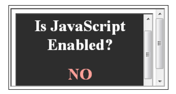
Figure 3.3.: Screenshot of the "designMode.html" file of Listing 3.14 displayed in Mozilla Firefox 3.6.12

First of all, an "iframe" tag that holds the attributes "id" and "onload" is given. The attribute "id" is used to address the element. The event handler "onload" executes the function "disableJavaScript" when the "iframe" tag loads. Inside the function, the "iframe" tag is linked to the object "CJiframe" by using the "id" value "clickjacking". After that, the iframe is set to "designMode='on". Thus, only the iframe is in the design mode and not the whole document. After that a new "iframe" tag with the "id" value "victim" is loaded inside the "iframe". Last but not least, the last line of the JavaScript code is used to set the "src" attribute of the "victim" iframe.