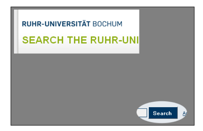
Figure 2.6.: Iframe with an SVG mask displayed with the web browser Mozilla Firefox 3.6.3

The code of the SVG is given in Listing 2.21. First of all, an "svg" tag with the namespace "svg" is defined. After that, a "mask" tag with the attributes "id", "maskUnits" and "maskContentUnits" is inside the "svg" tag. The attribute "id" holds the value "maskForClickjacking", which is exactly the value inside the "url" of Listing 2.20. The attribute "maskUnits" defines the coordinate system for the data of "x", "y", "width" and "height". The second attribute "maskContentUnits" defines the coordinate system for the contents of the "mask" with "objectBoundingBox" [42]. Inside the "mask" tag, there are two tags called "rect" and "circle". Each tag holds information to the position and is determined by the geometric shape the width and height or radius. The attribute "fill", with the value "white", ensures that the viewing whole in the mask is visible.