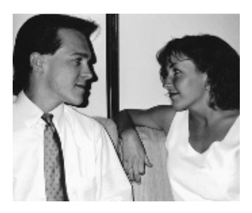
Figure 12-6 Fair fighting demands the finest communication skills.

person asks, "What am I angry about, what is the problem, and whose problem is it?" Learning how to fight fairly is essential because the "inability to manage personal conflicts is at the root of the crisis that threatens the structure of the American family" (Bach and Wyden, 1968, p. 31). A key point is that the way in which conflict is resolved determines the health of the relationship.