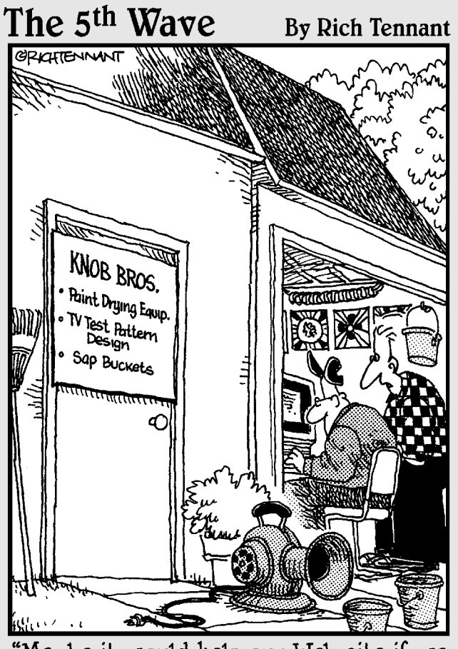
"Maybe it would help our Web site if we showed our products in action."