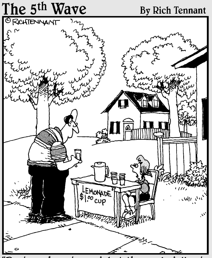
"Business here is good, but the weak dollar is killing my overseas markets!"