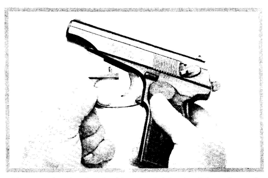
After ensuring that the pistol is unloaded, let the slide go forward. Leaving the hammer cocked, pull down on the front of the trigger guard and push it to the right or left.