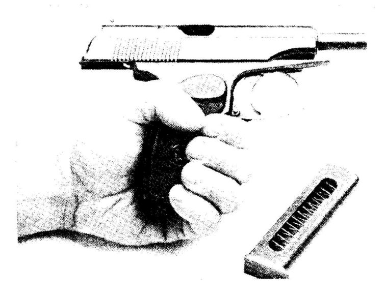
Disassembly. First remove the magazine and inspect the chamber and magazine well to ensure that the pistol is unloaded.