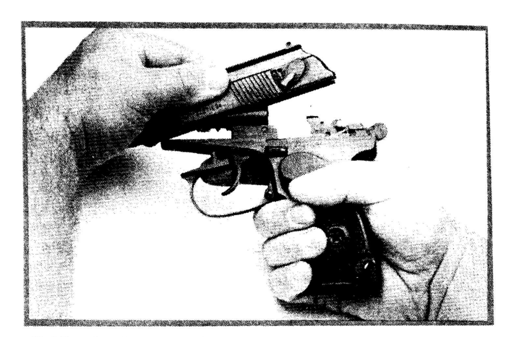
Holding the trigger guard in place with your trigger finger, draw the slide to the rear and lift upward until it comes off the frame.