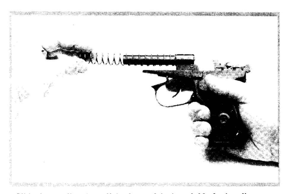
Slide the recoil spring off the front of the barrel. No further disassembly is required and all parts of the pistol are now exposed for proper cleaning.