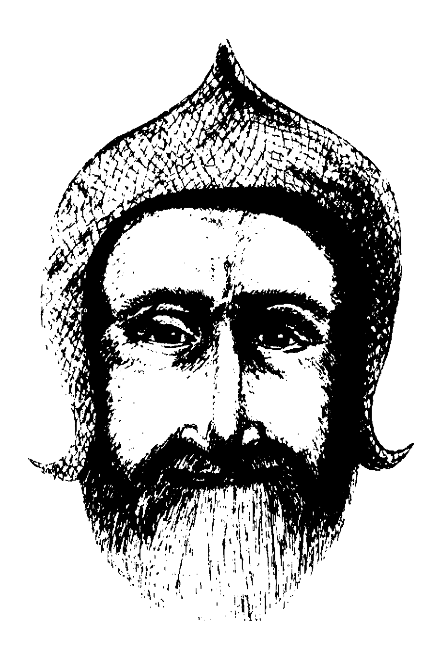
Drawing of Nostradamus, as seen by Elena in trance.