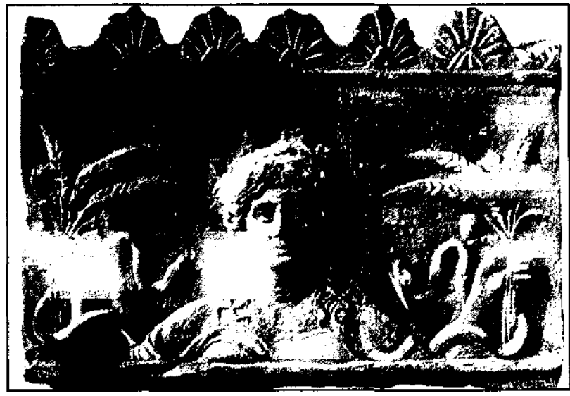
FIGURE 19. Demeter with barley', opium, and snakes.

A remarkable illustration in Erich Neumann's The Great Mother shows the Goddess in association with a beehive and holding poppy