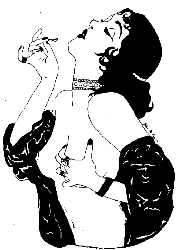
FIGURE 24. Cocaine Lil by John Powys.

while retail prices would rise astronomically. The new price structure made the drug money pie large enough for all parties to profit handsomely—governments and criminal syndicates alike.