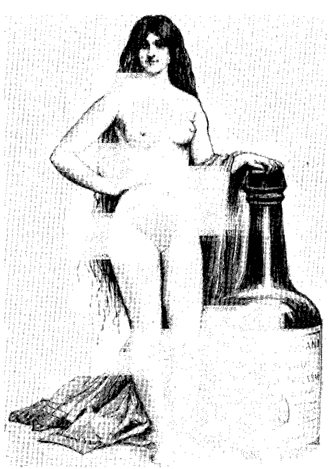
FIGURE 23. Advertisement for Vin Mariani.