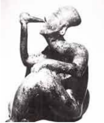
Photo 9 Snuffing pipe in use. Ceramic tomb figurine of an "entranced" man with a snuffing pipe shows hallucinogenic snuff to have been used in Mexico 2,000 years ago. From a shaft and chamber tomb in Colima, western Mexico, ca. 100 BC AD 200. Height 10 inches.

The cumulative evidence points to a southern origin—perhaps northwestern South America—for the early Mesoamerican snuffing complex. Why it should have disappeared from Mexico centuries before the Conquest while proliferating so spectacularly in South America and the West Indies is a mystery. Nor do we know the botany or chemistry of the Mexican snuffs. They could have been traded from South America ( huiica , perhaps?), but as has been noted, various local hallucinogens could also have been utilized, including acacia-like trees native to Mexico that have not yet been tested for hallucinogenic alkaloids. Apart from these possibilities, Mexico shares with South America not only tobacco, which was and is used as snuff in South America, but also at least one tryptamine-containing genus, Justicia , from which Indians on the Upper Orinoco make an intoxicating snuff. Clearly, much ethnobotanical and phytochemical work remains to be done.