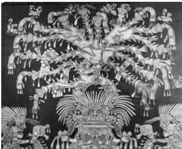
Figure 7 Ololiuhqui in art. Once thought to represent the male rain god Tlaloc, this spectacular mural from Teotihuacan, Mexico, dated ca. AD 500, actually depicts a great Mother Goddess and her priestly attendants with a highly stylized and elaborated morning glory, Rivea corymbosa , the sacred hallucinogenic ololiuhqui of the Aztecs.

In 1940, long before the identification of plants in pre-Columbian art assumed its present significance in relation to hallucinogenic research, archaeologists uncovered a complex of mural paintings at Tepantitla, a compound of sacred buildings within the great pre-Hispanic city of Teotihuacan, which flourished from the first to the eighth century AD north of the present Mexico City. These paintings have been dated to the fifth or sixth century A.D., when Teotihuacan was not only the greatest urban center in the New World but one of the largest cities anywhere, with perhaps as many as 100,000-200,000 inhabitants.