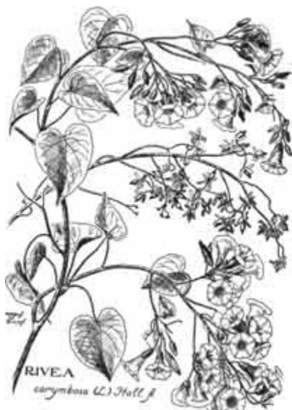
Figure 4 Rivea corymbosa