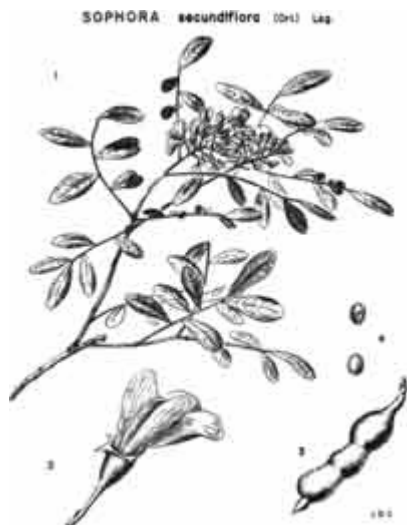
Figure 11 Anadenanthera peregrina

In curing, Datura preparations served to place the doctor in touch with the supernaturals for the purpose of ascertaining the cause of the illness, but were also used as medicine for the patient, being applied both externally and internally. Not only the Aztecs but many other Indians were quite familiar with the analgesic effects of Datura and used it effectively to alleviate pain. Matilda Coxe Stevenson (1915), for example, reports that among the Zuñi of New Mexico, who ascribe divine origin to Datura innoxia and whose Rain Priest Fraternity has a special relationship to the sacred plant, the curer administers the root to