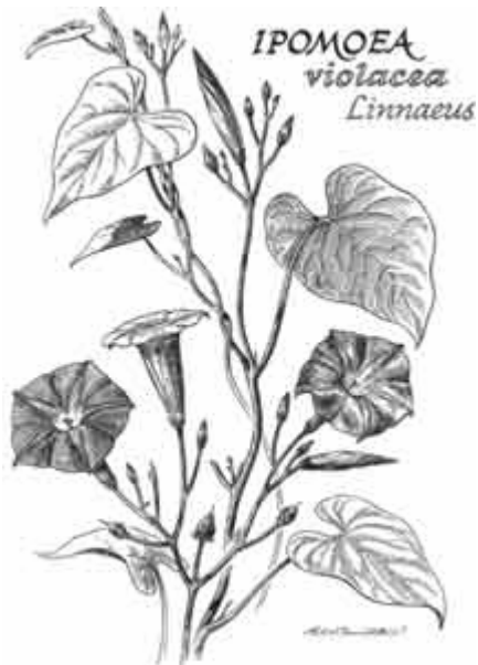
Figure 6 Ipomoea violacea