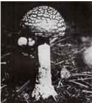
Photo 1 Amanita muscaria. The divine Soma of the ancient Indo Europeans and magic hallucinogenic mushroom of Siberian shamanism.

Wasson proposed that the "Aryans" arrived in the Indus Valley from their homeland to the northwest with a well-integrated ancestral cult of the sacred fly-agaric, and that what remained of archaic Siberian mushroom ritual in the eighteenth and nineteenth centuries actually represents a kind of fossil of the ancient ecstatic-shamanistic stratum in which the Vedic rites of the early second millennium BC had their ultimate roots. If so, then the Vedic priests would from the start have had to wrestle with the problem of substitutes for the divine plant, for the fly-agaric is not always and everywhere available and like most mushroom species cannot be cultivated. It can, of course, be dried and preserved. And here the Rig Veda's description of Soma's preparation—a dried, leafless, rootless, blossomless plant to which water was added to make it swell up again—certainly suggests dried mushrooms. Similarly, the effects of the divine inebriant—including sensations of enormous strength, already mentioned in the Koryak myth, and of flight to the ends of the universe—fit precisely those of Amanita muscaria . Likewise, once one accepts the idea that Soma was the fly-agaric, many previously obscure Vedic passages that allude with poetic metaphors to Soma's appearance fit remarkably well those of the fly-agaric in its different stages.