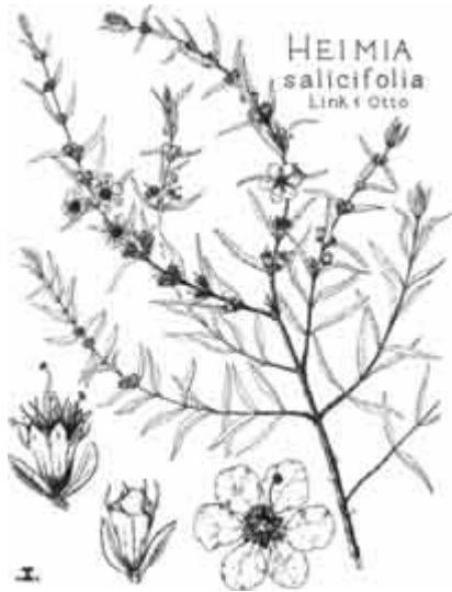
Figure 8 Heimia salicifolia