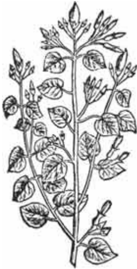
Figure 3 Ololiuhqui ( Rivea corymbosa ). As illustrated by Francisco Hernandez in his Rerum medicarum Novae hispaniae thesaurus ... , published in Rome in 1651.