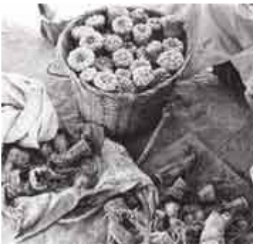
Photo 6 "Our game bags are full." Lupe's carrying basket filled to the brim with mature peyote plants. In the foreground, peyote roots, called the "bones" of the sacred cactus, cut off to be ritually deposited in the desert in the hope that new plants will grow from them. This accords with the widespread belief of hunting peoples in rebirth from the bones, which are believed to contain the life force or soul.

Ramón having admonished the companions repeatedly to "be of a pure heart," the actual hikuri harvest was ready to commence, and the pilgrims went off into the desert, alone or in pairs. Hikuri "hides itself well," and several of the companions had to walk a considerable distance before seeing their first peyote. Lupe, on the other hand, almost at once discovered a thicket of cactus and mesquite so rich in peyote that in a couple of hours she had filled her tall collecting basket. Occasionally she would stop to admire and speak quietly to an especially beautiful hikuri and to touch it to her forehead, face, throat, and heart before adding it to the others. We also saw people exchanging gifts of peyote. This seemed to us a very beautiful aspect of the pilgrimage. No ceremony in which peyote was eaten communally went by without this kind of ritual exchange, in which each participant is expected to share his peyote with every companion. A man or a woman would carefully divide a peyote, rise, and walk from individual to individual, handing over a piece and receiving one in return. Often an older participant would place his gift directly into the mouth of a younger one, urging him to "chew well, younger brother, chew well, so that you will see your life." But most often these ritual exchanges took place in silence as they were also to do in the concluding ceremony of "unknotting" that marked the formal end of the pilgrimage.