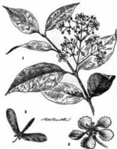
Figure 1 Banisteriopsis caapi