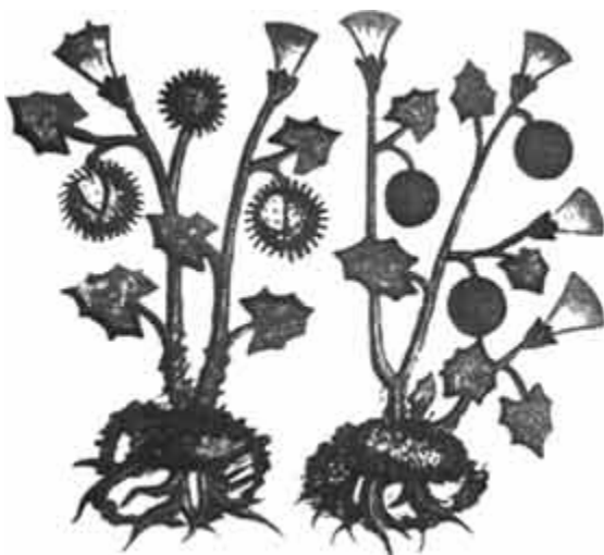
Figure 10 Datura . Two species, as depicted in the sixteenth century Aztec herbal known as the Codex Badianus.

Although they make offerings to the plant, call it the "real Kieri," and express great awe, if not indeed fear, of it, no Huichols today appear to be using Solandra medicinally or hallucinogenically. But the mythic descriptions of the powers of Kieri to bewitch and transform are too specific not to be based on actual experience, presumably at some time in the past. If Kieri is Datura in one part of the rugged Huichol country and Solandra in another, or if, as well may be the case, there are two Kieris, in the main potentially malevolent, one manifesting himself in Datura and the other in Solandra , we are confronted with the phenomenon of a supernatural being who manifests himself in the same culture in two related but distinct solanaceous species. But considering that Datura and Solandra share similar potentially dangerous chemical properties, that would perhaps not be so strange.