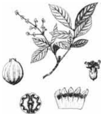
PSYCHOTRIA viridis L.