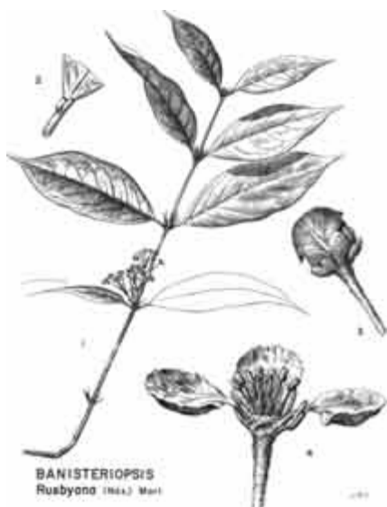
Figure 2 Banisteriopsis rusbyana

Syrian rue is actually only one of at least eight plant families of the Old and New Worlds in which harmala alkaloids are now known to be present. Botanically the most numerous and culturally the most interesting of these is Banisteriopsis , a malpighiaceae tropical American genus that comprises no less than a hundred different species, of which at least two, B. caapi , discovered and named by Spruce in the mid-nineteenth century, and B. inebrians , and quite possibly others, such as B. muricata , are the basis of the potent hallucinogenic ritual beverages the Indians of Amazonia call, depending on the local language, by such terms as caapi (more correctly, kahpi or gahpi ), mihi , dapa , pinde , natema , yajé , etc. In Quechua, the language of the Incas of pre-Hispanic Peru and of millions of Andean Indians today, the drink is eloquently called ayahuasca , meaning "vine of the souls," a term that has been adopted also by some non-Quechua Indians east of the Andes. Yajé (or yagé ) is a Tukanoan word widely employed in the northwest Amazon, and for the reason that by far the best anthropological analysis ever written on the complex mythological, symbolic, and social meanings of the Banisteriopsis drink in the aboriginal world comes from the Tukanoan Desana of Colombia (Reichel-Dolmatoff, 1971, 1972), that is what we will call it here.