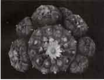
Photo 2 Lophophora williamsii . Peyote in flower; cultivated material from the Rio Grande of Mexico.