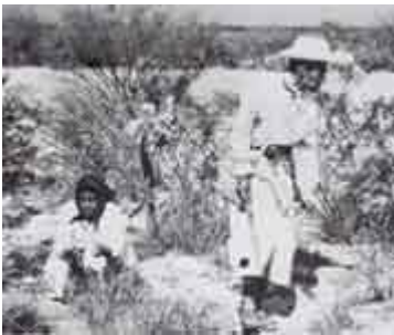
Photo 7 Hikuuri seekers. A Huichol peyotero and his wife searching the desert for the sacred cactus.