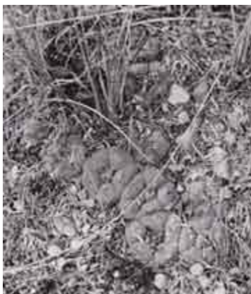
Photo 4 "There, there, the deer!" A clone of peyote, the gray green crowns barely extending above ground. Photographed in the north central desert of Mexico.

Ramón moved forward once more, Jose following close behind and to one side, his face lit up with the pleasure of discovery and anticipation. All at once Ramón stopped, motioning urgently to the others to come close. About 20 feet ahead stood a small shrub. He pointed: "There, there, the Deer!" Barely visible above ground under the bush were some flecks of dusty green—evidently a whole cluster of Lophophora williamsii . Although I have seen peyote plants growing in full sunlight, more often it is found like this—in a thicket of mesquite or creosote, shaded by a yucca or Euphorbia (especially Euphorbia antisyphilitica ), or close to some well-armed Opuntia cactus, such as rabbit ear or cholla . Its broad, flat crown is usually almost level with the earth and so is easily missed by the inexperienced eye).