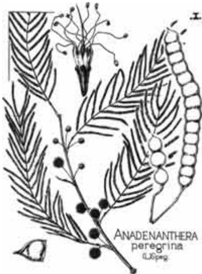
Figure 12 Amanita muscaria

In considering the major hallucinogenic snuffs, we should not forget that many of the scores of psychoactive plants of the New World could at least theoretically be used in this way, and that especially in South America there is much evidence for such experimentation. Even Ilex guayusa , the caffeine-containing holly that, along with its sister species, is widely utilized as a stimulating tea (e.g., mate = I. paraguayensis ), served as snuff, at least for some shamans of ancient highland Bolivia, judging from a recently excavated shaman's grave dated to ca. AD 500, that contained bundles of Ilex leaves together with a complete kit for preparing and taking snuff. The kit also includes clysters, so that the same plant might even have been employed as enemas (Schultes, 1972b).