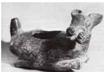
Photo 8 Deer, holding peyote cactus in its mouth. A snuffing pipe about 2,500 years old, from Monte Alban, Mexico. Length 5 inches; private collection.

Now we give attention to Mexico and the archaeological evidence for an ancient snuffing complex that dates back at least to the second millennium BC, apparently became extinct as a major technique of ritual intoxication before AD 1000, and today survives only in remote mountain areas of Oaxaca and Guerrero, where some curers are said to inhale the pulverized seeds of the morning glory (T. Knab, personal communication, based on the unpublished field notes of the late botanist Thomas McDougall). It has always seemed puzzling that the early Spanish missionaries, who were certainly alert to the many manifestations of ritual intoxication, seem not to have seen any evidence of snuffing, even in areas adjacent to the well-developed snuffing complex of the Caribbean island cultures. Powdered tobacco is mentioned, but there is nothing to suggest that it, or any other hallucinogen, was inhaled as snuff.