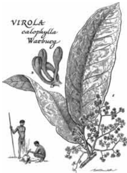
Figure 14 V. calophylla

Snuff prepared from Virola theidora alone, without admixtures, contains 5-methoxy-N,N-dimethyltryptamine in concentrations of up to 8 percent, along with smaller amounts of N,N-dimethyltryptamine and related alkaloids. Alkaloid concentrations vary in different parts of the tree, but the bark generally contains the highest percentage.