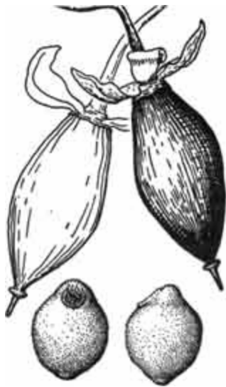
Figure 5 Rivea corymbosa . Capsules and seeds.

In the interim, there were to be two more research reports on the effects of morning-glory seeds. Santesson had been certain that alkaloids were present but was not able to identify them. In 1955, the Canadian psychiatrist Humphrey Osmond, who had long been interested in the use and effects of peyote, especially in the context of the Native American Church among Canadian Indians, experimented on himself with ololiuhqui seeds. His experience did not duplicate that reported historically from Mexico, but after taking 60 to 100 seeds he passed into what he described as a state of listlessness, accompanied by increased visual sensitivity and followed by a prolonged period of relaxed well-being. In 1958, V. J. Kinross-Wright published the entirely negative results of ololiuhqui experiments with eight male volunteers, of whom not a single one reported any effect whatever, even though individual doses ranged up to 125 morning-glory seeds!