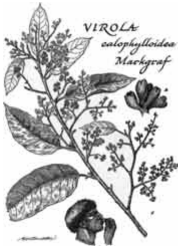
Figure 15 V. calophylloidea

Now, in the case of Virola snuffs, no such activating admixture seems to be absolutely required, since two new carbolines have recently been discovered in V. theidora itself (Schultes, 1970). Nevertheless, admixtures that can themselves be psychodynamically effective are frequently employed. Schultes (1972a), who visited the Waika (Yanomamo) in 1967 with the Swedish pharmacologist Bo Holmstedt, describes their technique as follows: