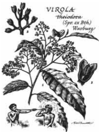
Figure 13 Virola theidora

But even this corrected classification did not clear up all the confusion, because snuffs were attributed by many writers to Anadenanthera , whether or not that genus actually occurred locally, and even though the observed method of preparation suggested that several different and even unrelated species might be involved. The mystery was cleared up when several species of Virola , a tree belonging not, like Anadenanthera , to the Leguminosae (pea family) but, like nutmeg, to the Myristicaceae, were confirmed as source of some of the snuffs once attributed solely to A. peregrina . Schultes was again prominently involved in settling this problem.