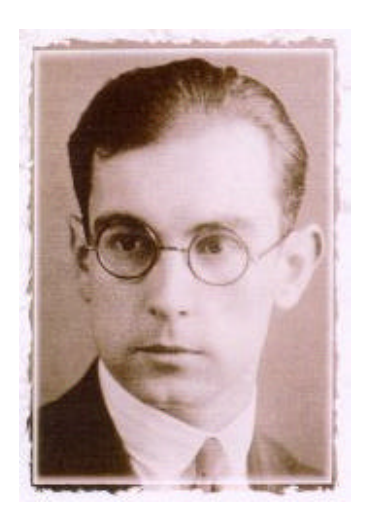
Enters the University of Zurich, 1926