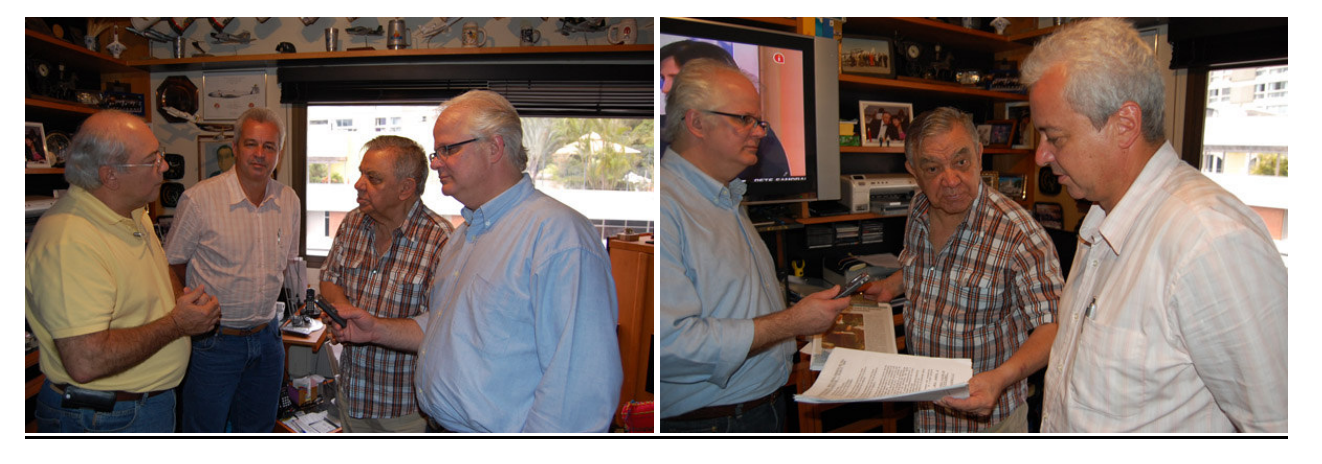
The former minister describes sightings of UFO in several areas of Brazil

The interviewee also was the commander of IV Regional Air Command (COMAR), in São Paulo, institution that controls the air space of the Southeast region, during the famous "UFO Official Night in Brazil", on May 19th 1986, when the area was flooded by the appearance of more than 20 flying spheres of more than 100 m diameter each, which were chased by 7 FAB's fighters F-5E and Mirage, sent from the air bases of Santa Cruz (RJ) and Anápolis (GO). This is one of the most important ufological cases in the country, which counted on the participation of the Embraer's president at that time colonel Ozires Silva, on board of a Xingu airplane heading from Brasilia to Sao José dos Campos. Ozires spotted an object and even chased it over Sao Paulo state. As it is known, the Air Force Minister at that time Octavio Moreira Lima went to TV in