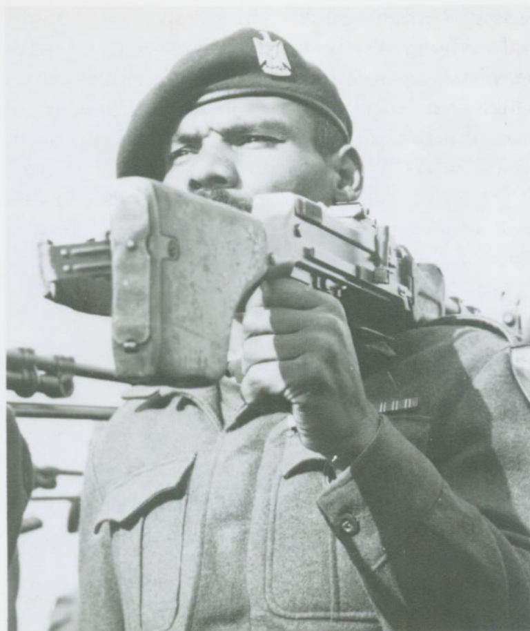
PLA soldier wearing that force's red beret (see Plate F) and a khaki battledress, probably from Syrian surplus. The ribbon—blue, with triple white/red/white stripes—is that of the Syrian Medal of Courage. Note Palestinian shoulder patch, and RPD series light machine gun.

(15) Jordan Arab Legion: shoulder strap loop of 5th Inf.Regt. (16) 7th Inf.Regt. (17) 8th Inf.Regt. (18) 9th Inf.Regt. (19) 15th Inf.Regt. (20) Jordan: cap badge worn in silver until 1956, gold thereafter. (21) Jordan: services, as opposed to combat arms, wear shoulder titles—here, engineers. (22) Jordan: signals shoulder title. (23) Jordan: officer's shoulder strap insignia, here lieutenant-colonel. Sequence is one, two and three stars for subalterns; crown for major, crown and one, two and three stars for lieutenant-colonel, colonel and brigadier; star above crossed sabres for major-general, crown above sabres for lieutenant-general, crown and star above sabres for general; crown above wreathed sabres and without shoulder title, field marshal. (24) Jordan: divisional patches were introduced c. 1968–70, and are worn by divisional staff and services, brigade patches being retained by combat units within divisions. This is 1st Inf.Div. (25) Jordan: 2nd Inf.Div. (26) Jordan: Royal Guards. (27) Jordan: Inf. brigade within 1st Inf.Div.—believed either 'Qadisiya', 'Hattin' or 'Aliya'. (28) Jordan: