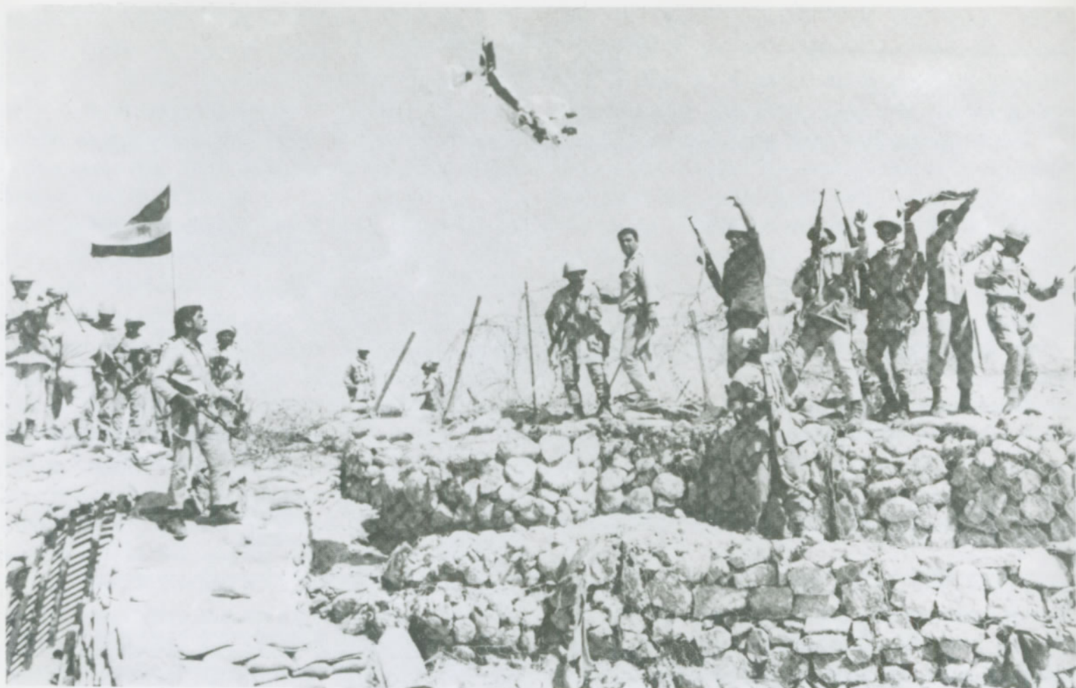
Ecstatic Egyptian soldiers raise their own flag over a captured Israeli strongpoint in the 'Bar-Lev Line', and hurl the Israeli flag away. The Egyptian victory cost many casualties, but was of enormous psychological value.

for. Their deceptive manoeuvres before the October War had a long history, beginning with the sand walls which the Egyptians built up on the west bank of the Suez Canal. The Israelis interpreted these earthworks as 'occupational therapy' for the Egyptians, bored with sitting by the Canal. They saw no significance in the fact that these walls were always a fraction higher than those built by the Israelis themselves on the east bank. Nobody expected an attack in the Muslim month of fasting, Ramadan. As part of the deception the Cairo papers reported that officers were to be given leave for the Omrah —the 'little pilgrimage' of Ramadan. In the weeks before the invasion troops in brigade strength openly moved out to the Canal on manoeuvres—but in the evening only a battalion returned. The bridges and pontoons for the crossing were moved at night. Soldiers at the Canal were not allowed to wear steel helmets until the moment of attack.