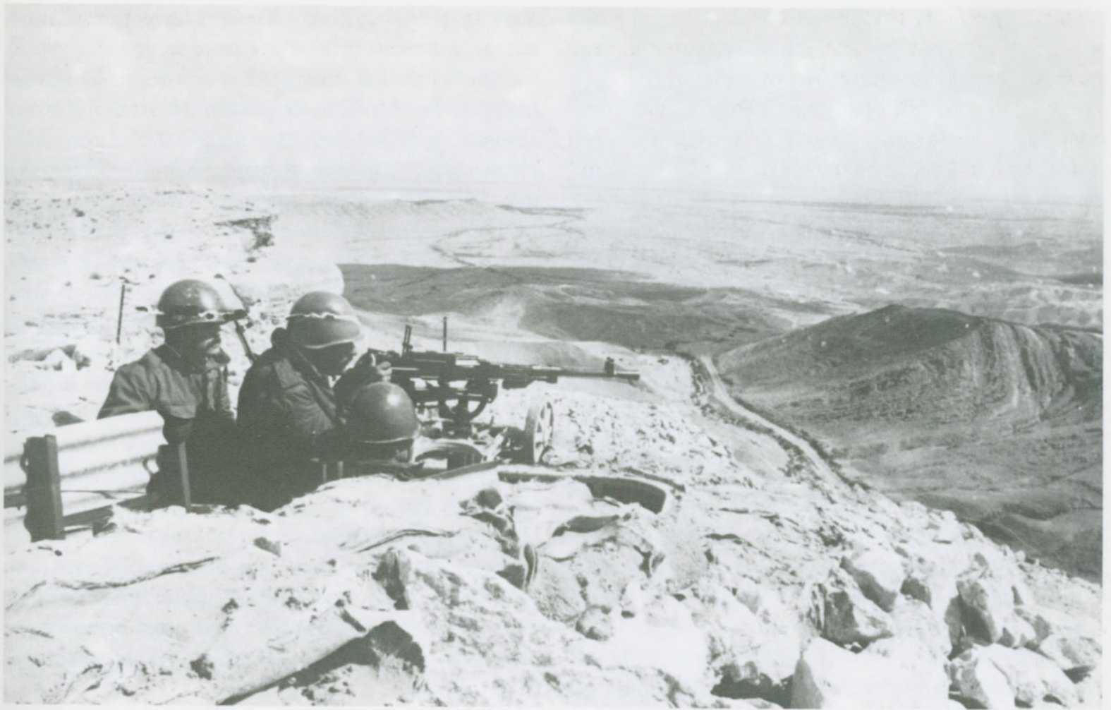
Egyptians crew a 7.62mm Soviet Goryunov machine gun, licence-built in Egypt, in an emplacement overlooking one of the passes in the southern Sinai recaptured in 1973.

by the explosions. This neither scared nor stopped the following wave . . . the Egyptian soldier continued advancing until gaps were opened in the defences . . . Great soldiers offer their lives cheap for Egypt.'