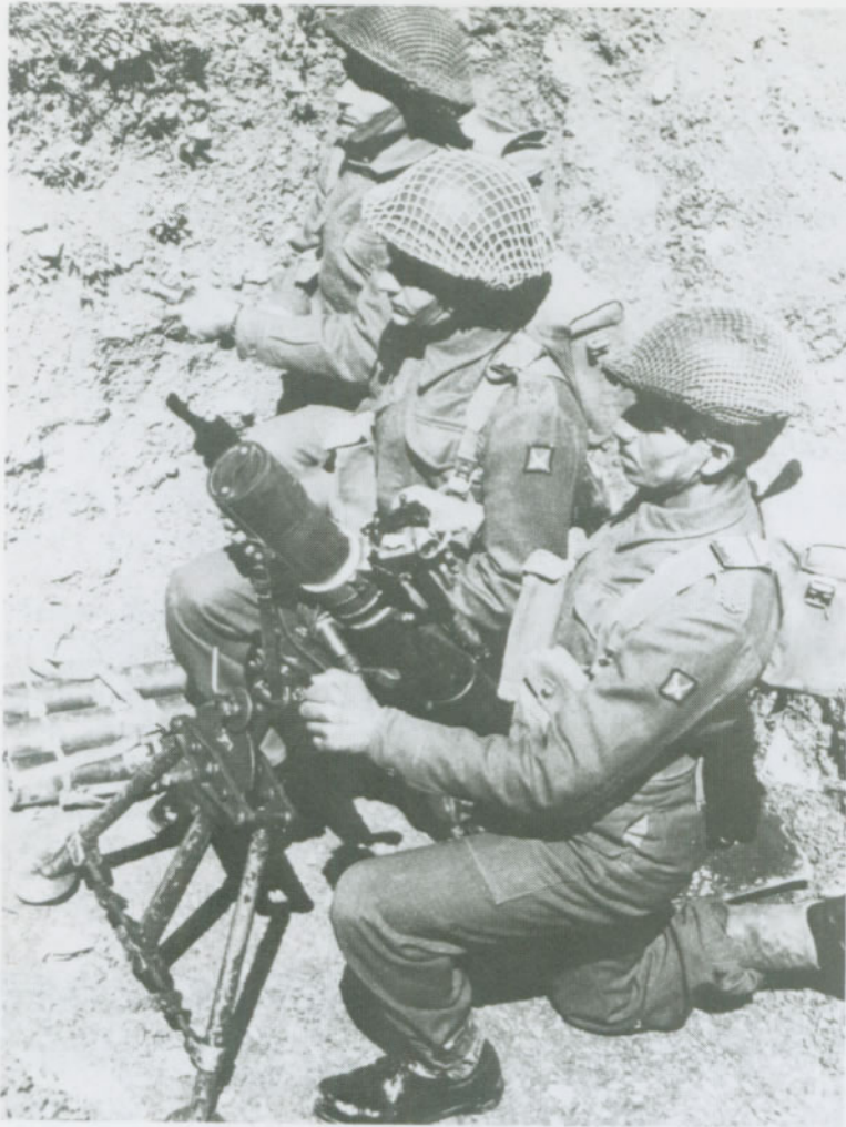
Jordanian troops with British-style battledress and equipment manning a 3in. mortar, 1956. The shoulder patch—crossed white sabres on a red square outlined dark blue—is believed to be that of the NCO School.

pockets may, perhaps, be felt easier to operate by touch alone than the press-studs on the front pouches? The purpose of the apparently folded-up skirts is unknown. A very wide variety of kit can be carried in this simple but highly practical item, ranging from small arms magazines, grenades and first aid kit, to anti-personnel mines and rounds for support weapons. The jerkin is claimed to be (partially?) inflatable for use as a life jacket; it is not easy to see how this works.