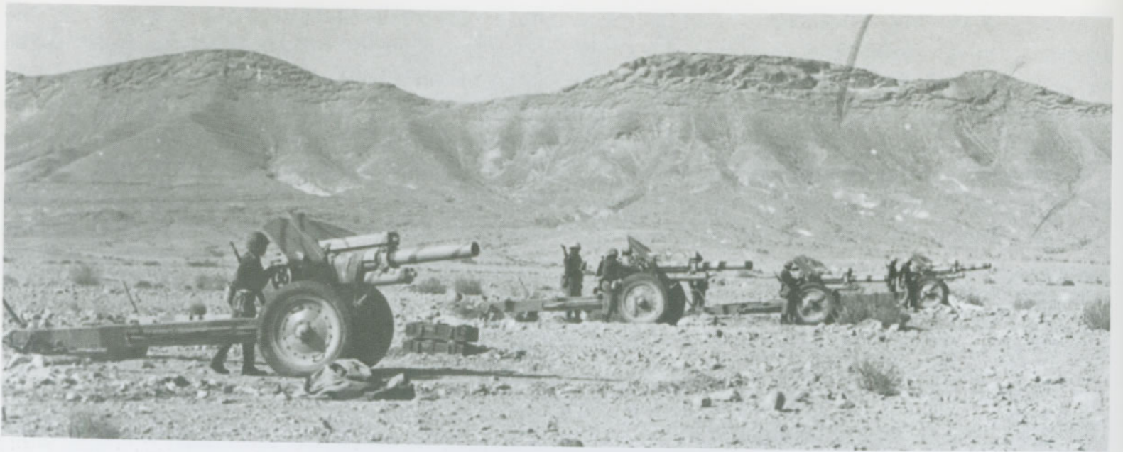
Egyptian artillerymen man Soviet 122mm guns, used in 1948-49 and 1956: with a six-man crew, this weapon had a range of 11,800m.

that seems to them to be correct. When High Command gets any sort of adverse report it delays passing it on to the Executive. In June 1967, the Egyptian General Staff did not tell President Nasser the terrible results of the Israeli air attack for eight hours.