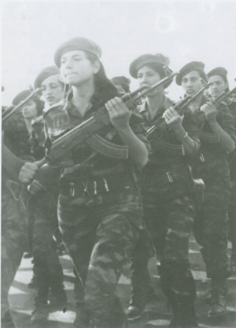
Syrian girls training as 'commandos'; they are not likely to see action, but all fit young people must undergo military training.