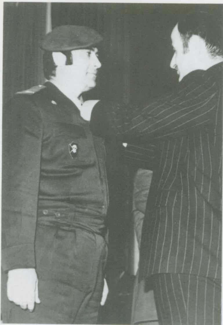
President Assad invests an officer of the Syrian Armoured Corps with a decoration. He wears the khaki cloth battledress uniform worn as service dress in winter—the reproduction of the photo has made it seem darker than its true tone. The beret is light grey, as are the shoulder boards, and the Corps badge is worn on the collar. An interesting death's-head badge is pinned to the pocket, and this is believed to indicate participation in some 'forlorn hope' type of action.

independent, well versed in fieldcraft and desert warfare. With 'Jordanisation' and mechanisation the army had to exchange the camel for the tank. The Bedouin, naturally enough in a way, tended to be passed over for promotion, in favour of better educated groups considered to be more suitable for the needs of the modern army—but who lacked the special qualities which had made the Bedouin such a fine soldier.