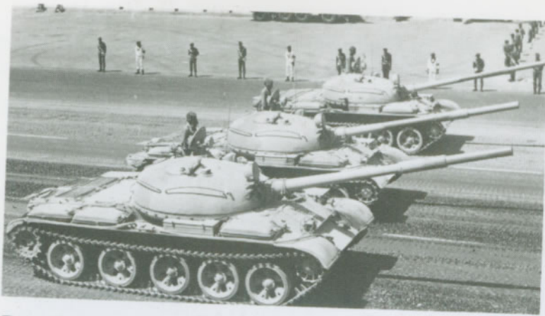
Parade of Soviet T-62 tanks, used in some numbers by both Egypt and Syria in the 1973 war. The main armament is the 115mm U5-T smoothbore gun firing fin-stabilised projectiles. These had awesome penetrating power when a hit was obtained; on the Golan Heights they were less effective over ranges of 1,500m, since the gusting highland wind cut down their accuracy. Israeli tankmen found that even a glancing hit from a more conventional APDS shell was enough to detonate the ammunition stored inside the turret of the thickly-armoured T-62.

heavy fire they deserted their men, who were mainly of the Shi'ite sect and therefore 'inferior'. Where officers and men stuck together they fought well, as in the battle of Tel Faq'r in 1967.