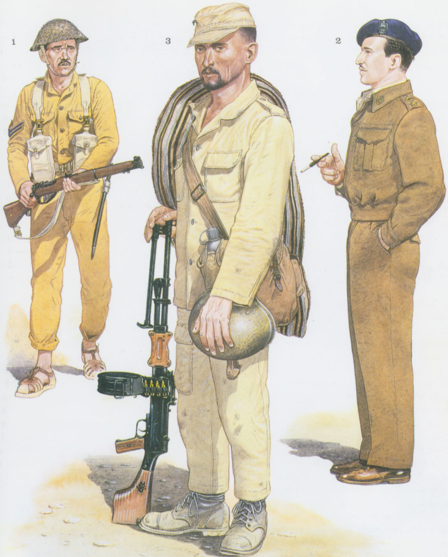
1: Egyptian infantry corporal, 1948-49 2: Egyptian infantry captain, 1956 3: Egyptian infantryman, Sinai, 1967

rdanian lem on unduly ensified, border, action, ex-UN y had a ected by l in the mitted ch. The ne West le. The em, the rusalem, and the between n on the i forces, ed their hem up n River s. ost dra- eli para- veteran ns. in a g for the ool and l bunker ir-strikes rdanian and the ity were hrs on 7 re forces ht to a the last morning, rdanians and then hesitan- he three from the d. These nfusion ;