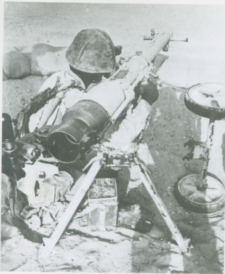
Egyptian infantryman with Russian-made 82mm recoilless gun, effective up to 800m; note sight box and oil can on ground beneath tripod. On the soldier's back can be seen his slung Kalashnikov, and an entrenching tool handle; and note pattern of helmet cover.