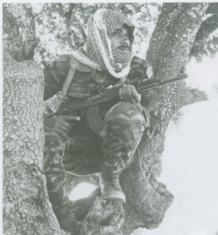
PLO guerrilla in 'Fatahland'—the southern Lebanon refuge—peering across the border into Israeli territory. The camouflage fatigues, of French appearance, are in fact made in East Germany; this man has a Palestinian shoulder title temporarily attached. The ubiquitous Kalashnikov series is the main personal weapon of most PLO groups; Degtyarev light machine guns and RPG-7 rocket launchers are the most common support weapons. During their long and ruthless campaign against Israeli settlements the PLO have become skilled at fieldcraft, but their losses have been high.

Khaki baratheia service dress cap with red band,