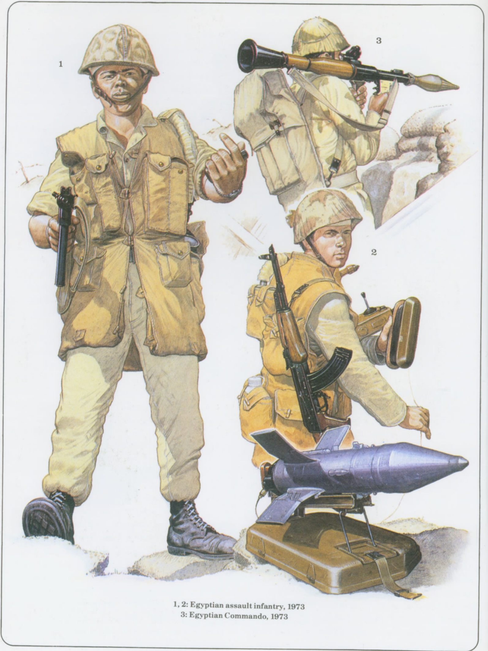
1, 2: Egyptian assault infantry, 1973 3: Egyptian Commando, 1973