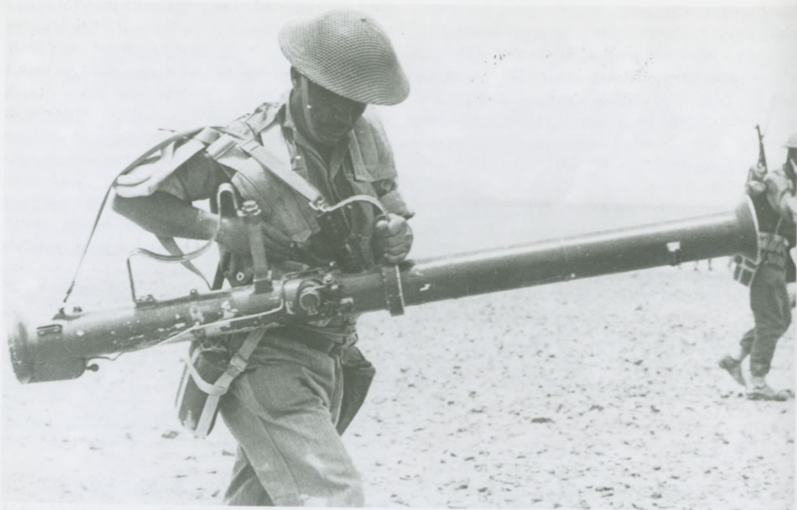
Jordanian infantryman of the 1960s, wearing a lightweight denim combat uniform, basically British webbing, and carrying the US 3.5in. rocket launcher.