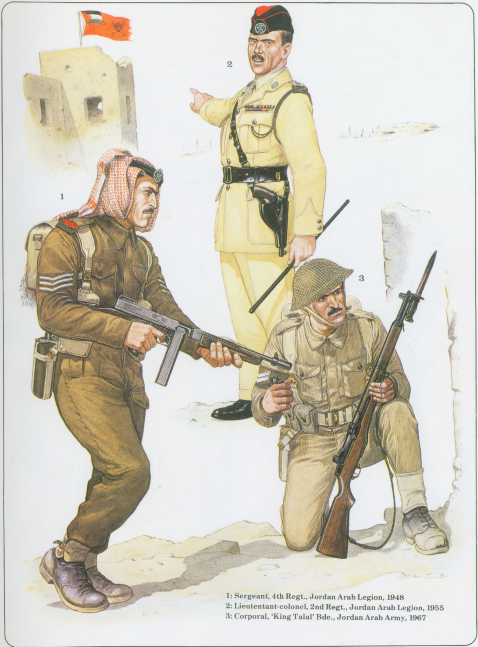
1: Sergeant, 4th Regt., Jordan Arab Legion, 1948 2: Lieutenant-colonel, 2nd Regt., Jordan Arab Legion, 1955 3: Corporal, 'King Talal' Bde., Jordan Arab Army, 1967