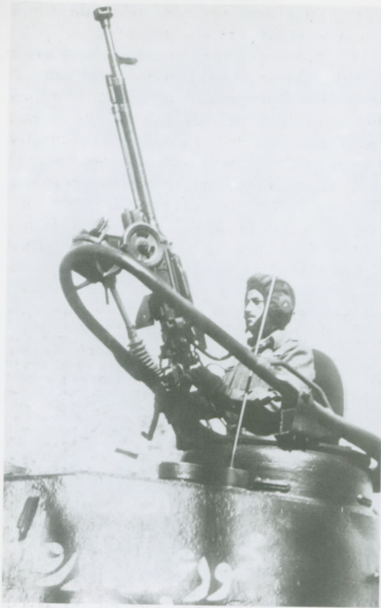
A Syrian tank commander photographed during the 1961 crisis, when the 'union' with Egypt broke down and Egyptian troops stationed in Syria attempted to take over the country, leading to several inconclusive skirmishes. The tank is the Russian T-34/85, fitted here with the heavy DShK anti-aircraft machine gun. The commander wears khaki battledress of British appearance, and the black canvas Soviet helmet.