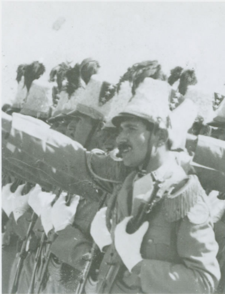
Syrian officer cadets take an oath of allegiance to president and nation at their passing-out parade at Damascus; these young men are as carefully chosen for political reliability as for leadership potential. The uniform is a four-pocket tunic and slacks in light khaki drill with gilt buttons, adorned with blue epaulettes with gold crescents and yellow fringes. The peaked shako is of white fleece with blue feathers, a blue panel with gold stars and trim, and gold false chin cords. Note in foreground the size and placing of the type of round shoulder patch illustrated on Plate H. (Author's collection)

ance impressed the Israelis and heartened the Jordanians.