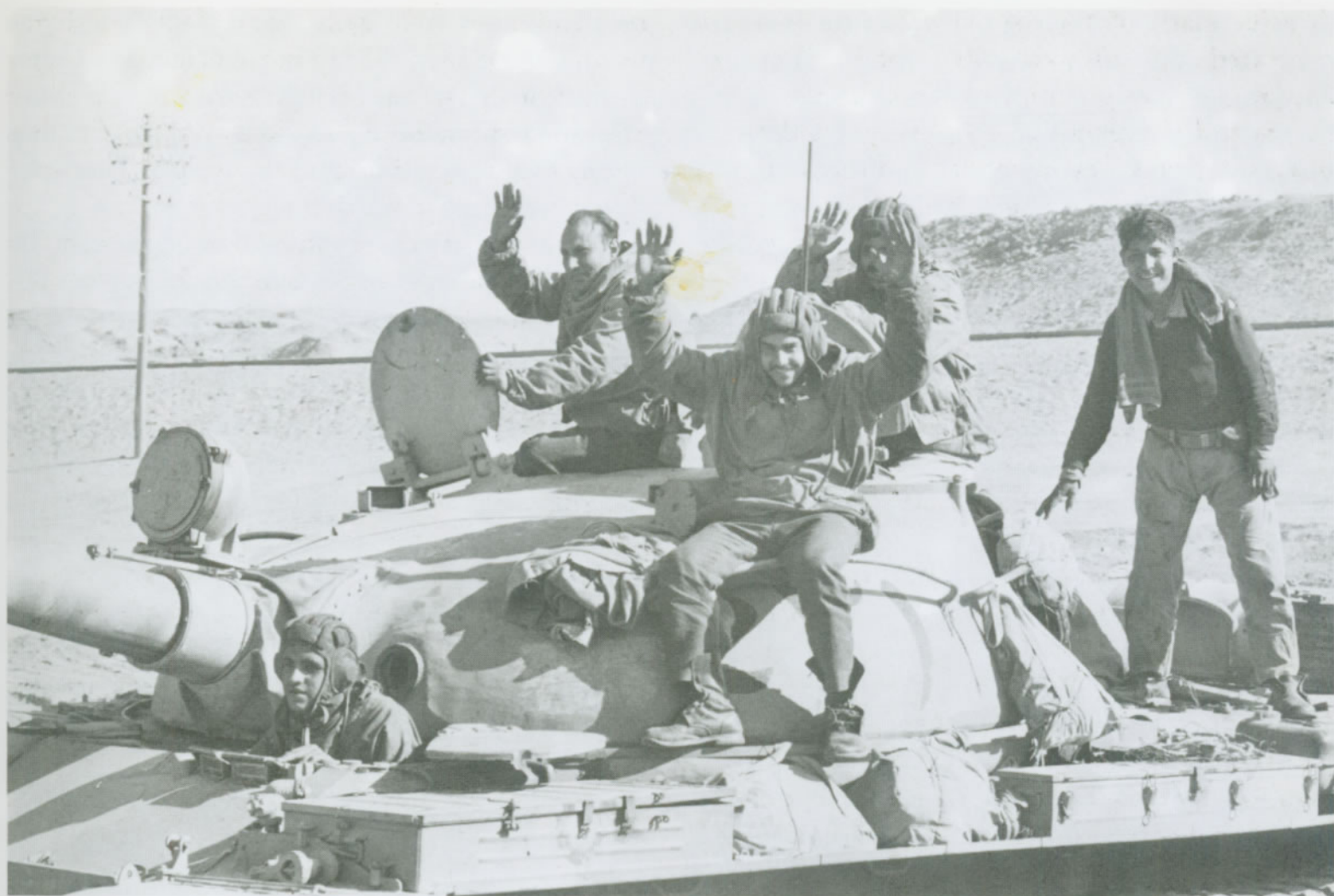
T-62 crew of Egyptian 3rd Army photographed during the disengagement of February 1974. Pale khaki drill and olive drab field uniforms are both visible; the helmets are the black canvas Russian type; and note the pull-over hooded anoraks, which are light brown drab in colour.

developed: This was not the result of cowardice, as has been suggested; it was the backfire of inept propaganda. The Syrian Government wanted to induce the super-powers to impose an immediate cease-fire, so it announced that Kuneitra—the ‘capital’ of the Golan—had fallen to the Israelis. In fact the Israelis were several hours away from capture, but the Syrian soldiers, hearing the broadcast, knew that with Kuneitra gone their line of retreat was cut. Improperly led, the troops headed for home.