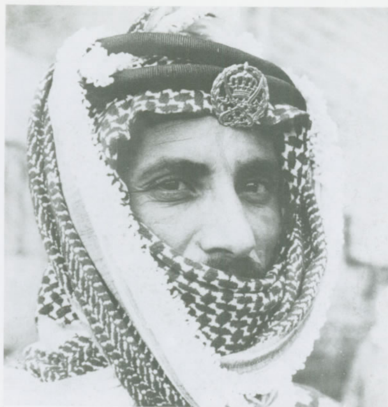
Splendid portrait study of a Jordanian Arab Army soldier photographed on guard at the Damascus Gate of the Old City of Jerusalem in the 1960s. Note detail of shemagh, agal, and cap badge.

The PLO forces were involved in much more conventional military action during the Lebanese Civil War of 1975–77, and since then against the Israelis. With some artillery and armour support they fought the Lebanese Army, the Christian 'private armies' and, at times, the Syrian Army. After 1977 they fought several actions against Israeli columns sent against the PLO strongholds in southern Lebanon.