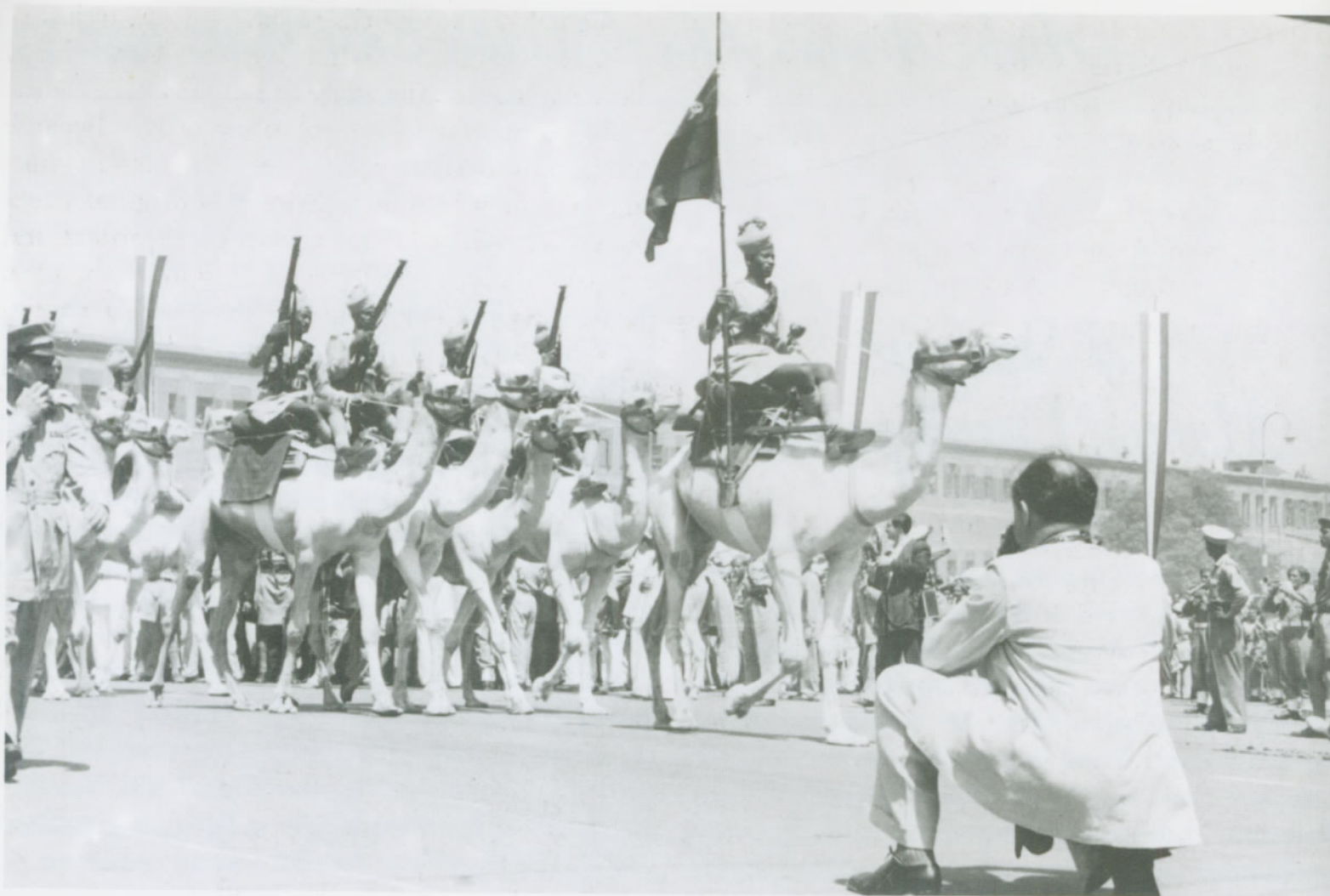
The Egyptian Camel Corps take part in a parade through Cairo in 1953. Most of these soldiers were Nubians or Sudanese, and they provided contingents which saw action in both 1948-49 and 1956.

to experiment with new weapons, armour and equipment. The 1973 war was fought basically between American equipment used by the Israelis and Soviet equipment used by the Egyptians and Syrians. The great tank battles of the Sinai Desert and the Golan Heights were super-power battles by proxy.