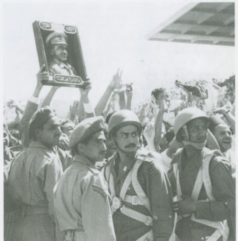
Men of Egypt's first paratroop battalion, photographed in Cairo during the first anniversary celebrations of the revolutionary regime, 1953. One man holds up a portrait of Gen. Naguib. Note large berets, light khaki drill battledress uniform, and chevrons in arm-of-service colour. The helmets and harness are British.

By 1967 the Egyptians and Syrians were Russian-equipped and Soviet military doctrine increasingly made itself felt, particularly in the pre-1973 period. During the War of Attrition the Egyptian Army was largely a Russian creation, and for the Russians the war was an opportunity