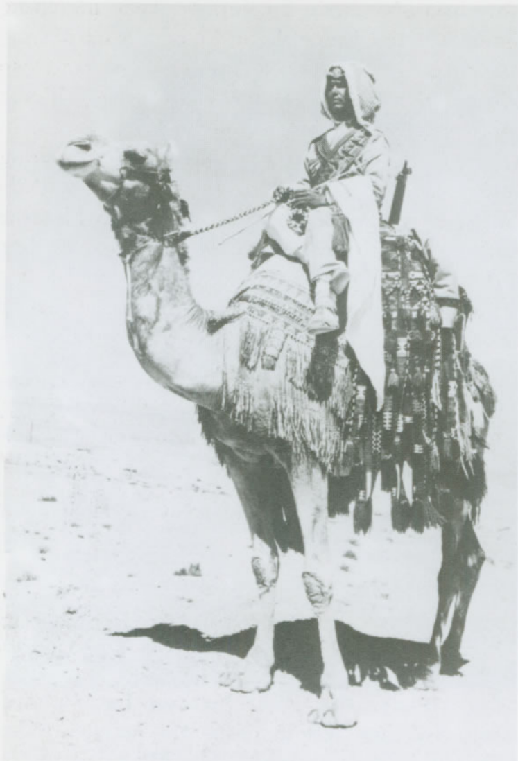
Bedouin camel trooper of the Desert Patrol—Badieh—photographed in 1956. This crack desert gendarmerie force, raised in 1930/31 by the young Maj. John Glubb, was the first to recruit the fiercely independent Bedouin—as opposed to the urban Haderi—into the Jordanian forces of law and order. It symbolises the type of soldier upon whom the Hashemite monarchy has always been able to depend for courage, resource and complete loyalty.