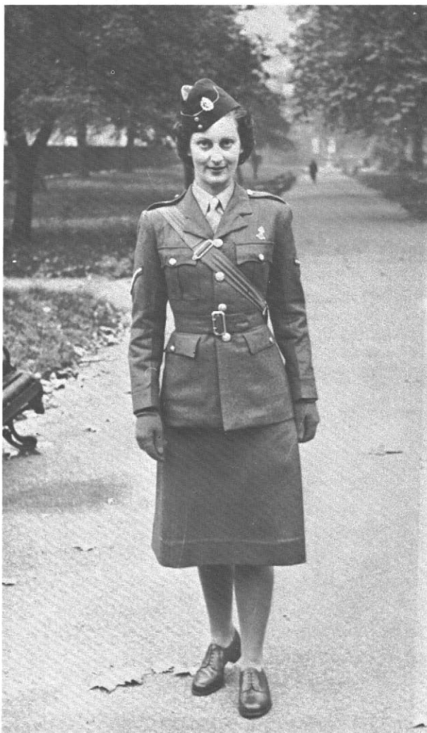
British ATS lance-corporal in walking-out dress, wearing the basic khaki uniform with the red and blue forage cap of the Royal Artillery, and the RA badge pinned above the left breast pocket. See Plate A2.

The administrative and logistic needs of a sophisticated modern army are so vast, the proportion of rear-area manpower to fighting man-