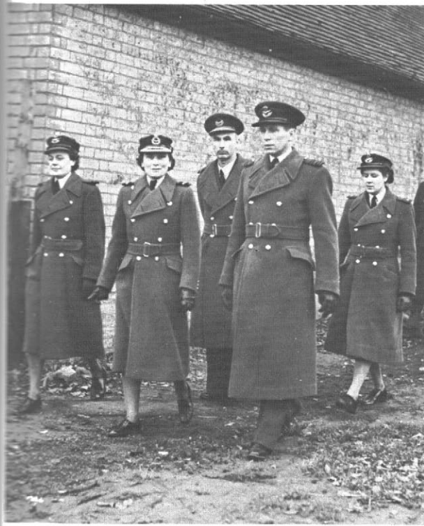
WAAF and RAF officers wearing greatcoats; the similarities between male and female uniform, which underlined the integration of the two services, are apparent here.

parachuted into France in February 1944. Through the loss of several other leaders she became the commander of no less than 7,000 Maquis fighters in the Auvergne, rallying them and leading them in battle against the Germans when the time came to link up with the Allied armies which landed in the south of France.