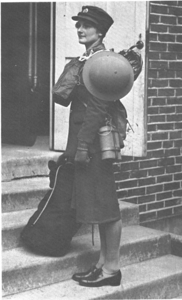
ATS girl in full marching order, with gasmask satchel strapped across the chest and gascane rolled and attached to the shoulders. The water-bottle is slung on the left hip in a leather 'cradle'; the steel helmet is looped by its chinstrap to the left shoulder-strap of the tunic. The kitbag is dark blue.

power so striking, that no state can afford to ignore the potential contribution of women. Against heavy initial opposition from conservative elements, women came to play a vital rôle in the British war effort of 1914–18, though at this stage almost exclusively on the home front. Their social emancipation is generally recognized to owe a direct and incalculable debt to their participation. As in so many fields, the lessons of war were forgotten in peacetime, and the outbreak of World War II found the authorities unprepared for the task of harnessing the willingness and skills of the nation's women. Their contribution had not been forgotten, however, and despite isolated examples of resistance to the idea of women in the