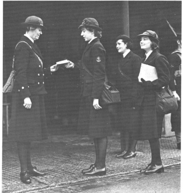
Inspection of passes at the gate of a WRNS training establishment. The 'pudding basin' hats with the gold-lettered tally of HMS Drake date the photograph no later than early 1942. The CPO on the left is identified by her brass buttons and cuff buttons. The blue side-bags worn slung by the two ratings in the centre contain civilian-style gasmasks.

In the early part of the war the authorities still favoured the Bond Street-inspired 'pudding basin' hat for ratings, a soft-crowned, wide-brimmed