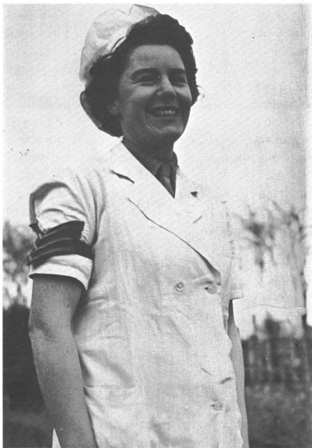
Traditional duties . . . an ATS sergeant cook, in white beret-style headgear and overall.

The full range of duties performed by ATS personnel is too great to list. They supported or were attached to nearly all branches of the services, under army command; and in particular to the RE, RASC, RAOC and REME. Apart from the few trades mentioned above, they drove scores