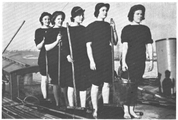
Above A small WRNS working party about to swab decks, pre-1942. They wear the early model hat, also with HMS Drake cap tally; crew-necked dark blue sweaters; and rolled-up dark blue slacks.