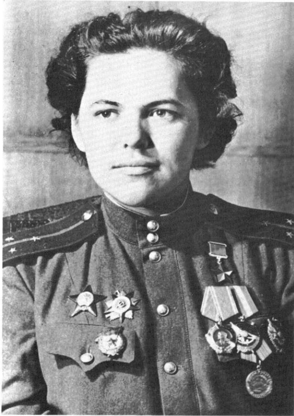
A Red Army woman officer in the uniform of 1943-45: the rubaha acquired a stand collar without patches but with two small buttons; rank and arm-of-service was indicated on traditional shoulder-boards; the front buttons became visible; and breast pockets were worn only by officers. The field shoulder-boards were in khaki cloth, edged and lined with the arm-of-service colour—here, apparently, the red of the infantry, who normally did not wear an identifying badge on the shoulder-board in the manner of other branches. The rank is Senior Lieutenant, indicated by one central red line and three silver stars. Decorations are, on her right breast, the Orders of the Red Star and the Patriotic War, above the Guards unit badge; and on her left breast the Gold Star of a Hero of the Soviet Union, above the Order of Lenin and what appear to be two separate awards of the Order of the Red Banner, above the medal for the Defence of the Caucasus.

F1: Germany: Luftnachrichtenhelferin, spring 1941 The cap, skirt, dark grey stockings and shoes would be the same as those worn by F3. Since November 1940 the Luftwaffe breast eagle was worn; and note the necktie pin in the same shape. The ranking of Betriebsgruppenunterführerin is worn on the cuff, in the pre-July 1941 style; and as yet there is no silver collar piping, although from this rank upwards the silver 'pip' is worn on