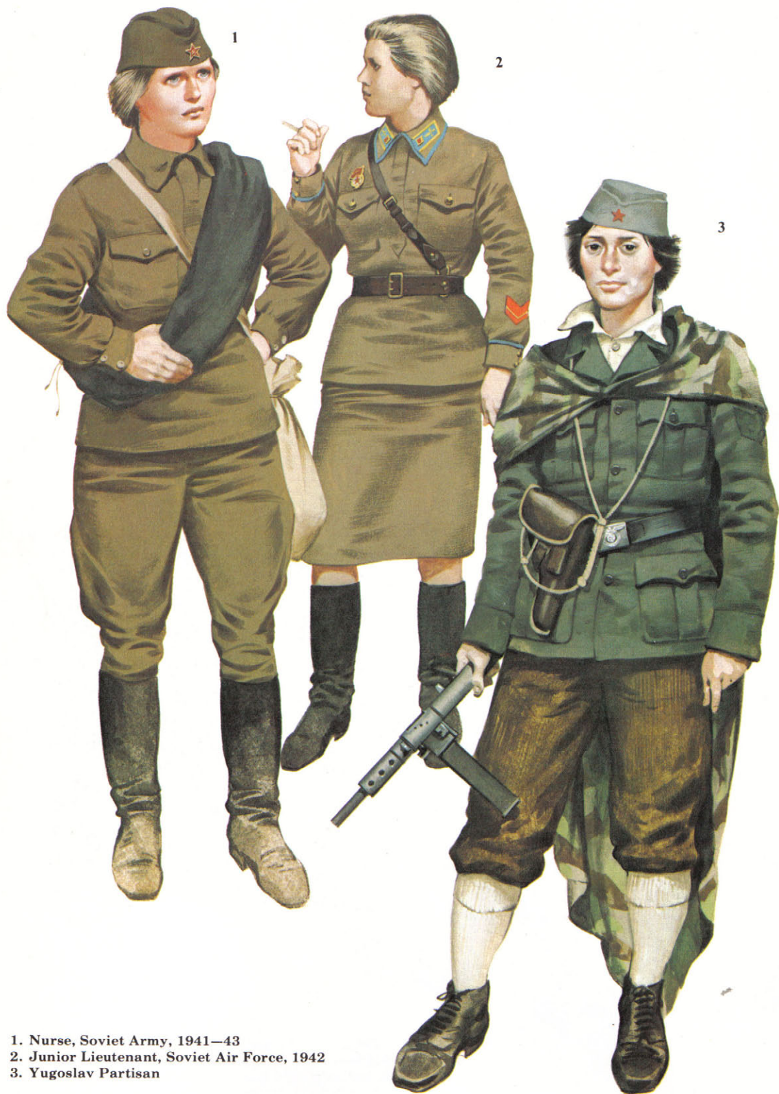
1. Nurse, Soviet Army, 1941–43 2. Junior Lieutenant, Soviet Air Force, 1942 3. Yugoslav Partisan