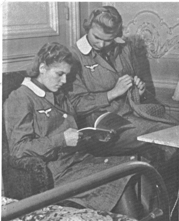
Nachrichtenhelferinnen des Heeres, wearing the mouse-grey smock-dress with a detachable white collar issued as a working overall. (Brian L. Davis)

of these staff assistants. On 12 September 1942 an OKH order instructed that those Stabshelferinnen who had served over one year in France were to be exchanged for those serving a similar period in the East—an order reflecting the relative popularity of the postings, no doubt, and the need to maintain morale among the assistants serving under the harsher conditions of Poland.