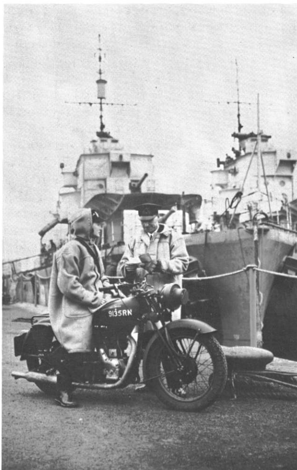
WRNS despatch rider in winter duffle-coat; see Plate C1.

but with the same insignia as male personnel, apart from the cypher in the other ranks' brass cap badge. The other ranks' cap had a glossy black leather peak, and that of officers a cloth-covered peak. Officers wore the RAF officers' cap badge.