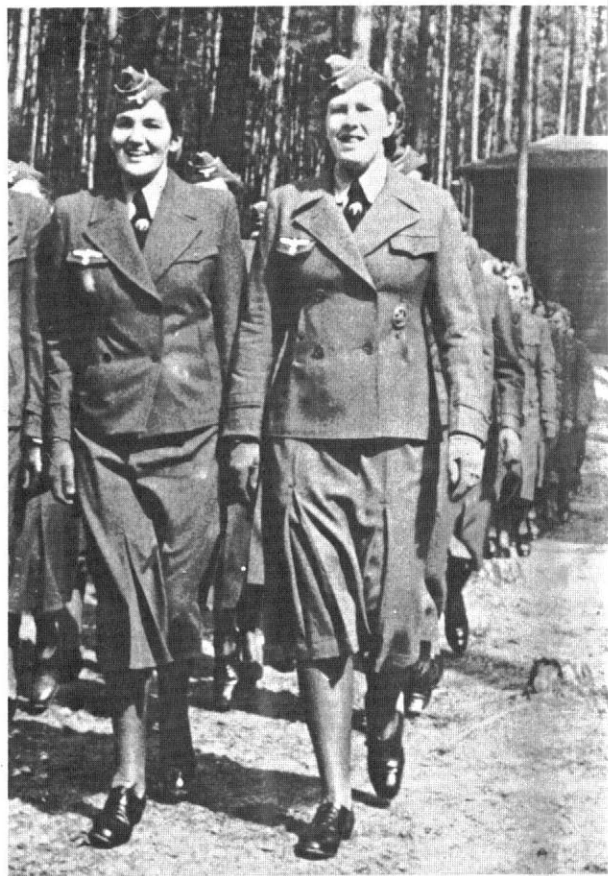
A damaged photograph, which nevertheless shows fairly clearly the uniform of the German Nachrichtenhelferinnen des Heeres. Note the unusual features of the jacket; see Plate Gz.

The army's Nachrichtenhelferinnen served throughout occupied Europe, suffering many privations as a result of wartime conditions. As representatives of the German way of life in a foreign country they were considered to be under the protection of German soldiers. Their reputation and welfare were mentioned in an OKW order to the effect that 'The soldiers' treatment of these German women must be the same as their conduct toward their own wives, mothers, sisters and daughters. It is a matter of honour for any decent German to behave correctly towards every German woman, especially those working alongside them in an enemy occupied country. Enemy propaganda has tried to besmirch the image of the Nachrichtenhelferinnen by spreading malicious gossip and evil rumours. With a whispering cam-