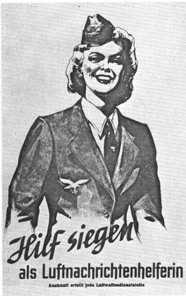
Poster appealing for recruits for the Luftnachrichtenhelferinnen, 1941.

general civil service of other countries. With the outbreak of war the Luftwaffe, in particular, experienced a great need for women personnel in the communications, telephone and telegraph, and air warning systems, where they worked alongside male technicians. As war pushed the defensible boundaries of the Reich outwards, they too moved into the occupied territories in the same way as their army counterparts.