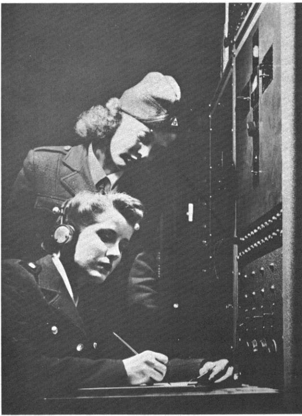
Many American women joined non-military organizations to help their country's war effort. Here uniformed Civil Defence workers man a switchboard.

backing material. On the white jacket the propeller was dark blue, the anchor light blue, on a white backing. The ranking was rather similar to British practice, in light blue on the blue jacket and dark blue on the white jacket. Officers wore the cap badge of male officers, a gold national eagle over a silver shield over crossed anchors in gold on a dark blue backing. Chief petty officers wore a vertical gold foul anchor with the silver letters 'USN' across the shank, as their male counterparts.