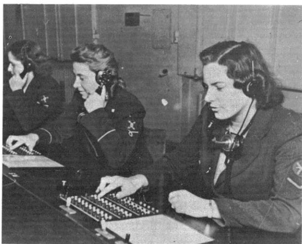
Group of Luftnachrichtenhelferinnen manning a switchboard, some time between July 1941, when this type of arm ranking came into use, and October 1943, after which the Führerin—in the centre—would have silver collar piping. Note trade patches of Flugmelde (air raid warning) personnel, worn by girl on right; and qualified telephone operator, worn by the Führerin in the centre. The latter also has the single silver command stripe around her cuffs, described in the text.

Positions of command, as opposed to actual grades within the service, were marked by 5 mm aluminium braid stripes around the cuffs of the jacket, greatcoat and working smock, 12 cm from the bottom of the sleeve. Grades in charge of a Betriebszug wore one stripe, and grades in charge of a Betriebskameradschaft wore two. (The basic unit of one Haupthelferin and up to eight Helferinnen was termed an Ln-H-Betriebsgruppe . Two to four Gruppen made up a Betriebszug , normally commanded by a Führerin; and two to four Züge made up a Betriebskameradschaft , normally commanded by an Oberführerin.)