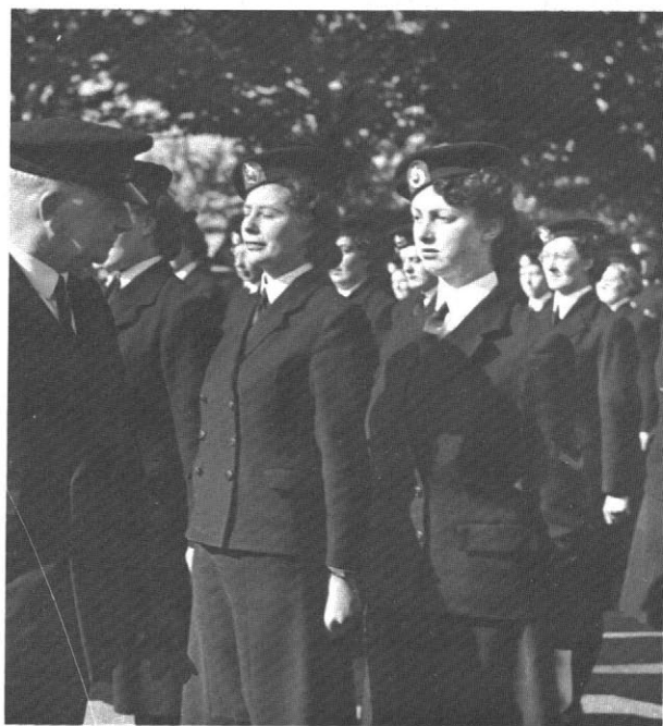
Ratings acting as Royal Marines auxiliaries, wearing the dark blue uniform with a peakless dark blue cap enlivened by the Marines' gilt globe and laurel cap badge on a red cloth patch.

In 1927, however, there appeared in the Army List a reference to FANY, 'officially recognized by the Army Council as a voluntary reserve transport unit'. In 1937 the title became 'Women's Transport Service FANY'. The references to both nursing and yeomanry were now completely outdated, as driving was now the corps' main function. They were also fully trained in signals procedures and techniques, radio communications and map-reading. With the revival of the women's services in 1938 an ATS/FANY driving section was created, bringing into the young ATS an immediate transfusion of some 1,000 trained drivers. The War Office gave an assurance that the identity of the FANY would be fully preserved, and the 6,000 or so FANYs who served with the ATS wore their own scarlet shoulder flashes with the initials of their organization. Their main duty was training ATS drivers at their Camberley driving school. Under the National Service Act they became full members of the ATS. Their responsibilities later expanded in many areas, and as a voluntary organization they retained and financed their own London headquarters, training volunteer FANYs in many duties. They wore their own uniform, similar to that of the ATS but