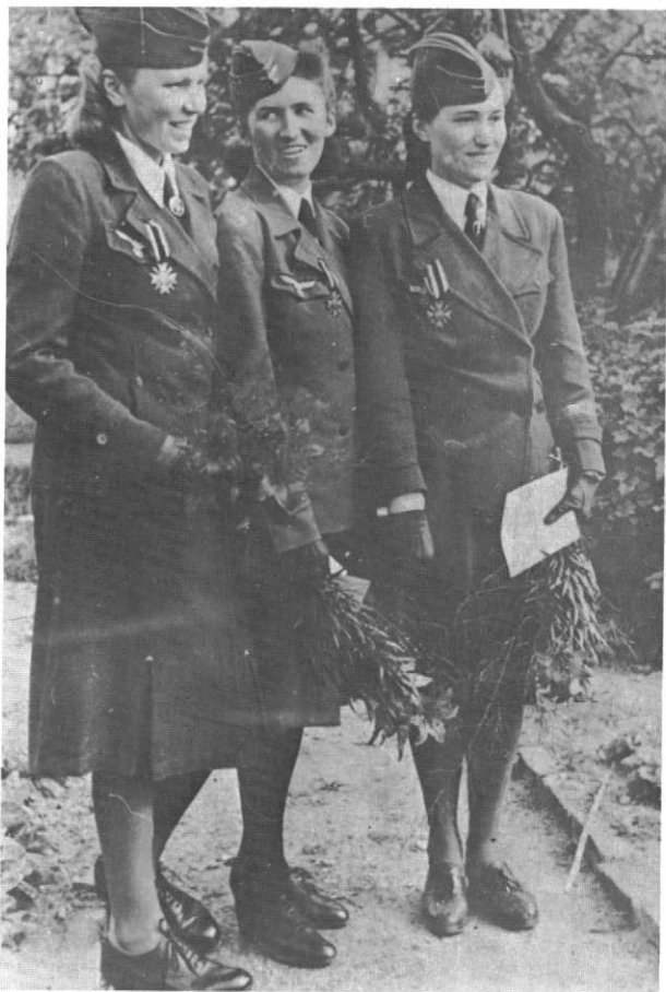
Three German army women auxiliaries pose for a photograph after being awarded the War Service Cross with Swords. All wear the silver and black 'blitz' tie brooch; the girl on the right can just be seen to wear the Stabshelferinnen des Heeres cuff title on the left sleeve above the buttoned tab. (Brian L. Davis)

The West had top priority in the deployment of Stabshelferinnen from late 1941, with the bulk going to OKH, and the headquarters of Army Groups and Armies. With the progress of the campaign in the East, however, and the use of Poland as a major reinforcement and replacement staging area, the 'General Government' (as that unhappy nation was termed by the Germans) soon vied with France as the main area of employment