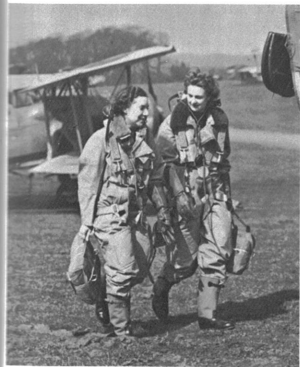
Women radio mechanics, who flew in Royal Navy aircraft during trials of equipment, dressed here in full flying suits and parachute harness for a flight in a Walrus ASR flying boat.

field and flying wear. (Shirt, tie, and black shoes and stockings had to be privately bought.) There were also a dark blue greatcoat, and a Field Service cap of the same shade, with a brass badge on the left side at the front. Rank was indicated on the shoulder-straps, one and two gold stripes identifying Second and First Officers. A pair of gold embroidered wings were worn on the left breast by all pilots. The various developments of normal RAF flying clothing and boots were issued progressively, including Irvin suits.