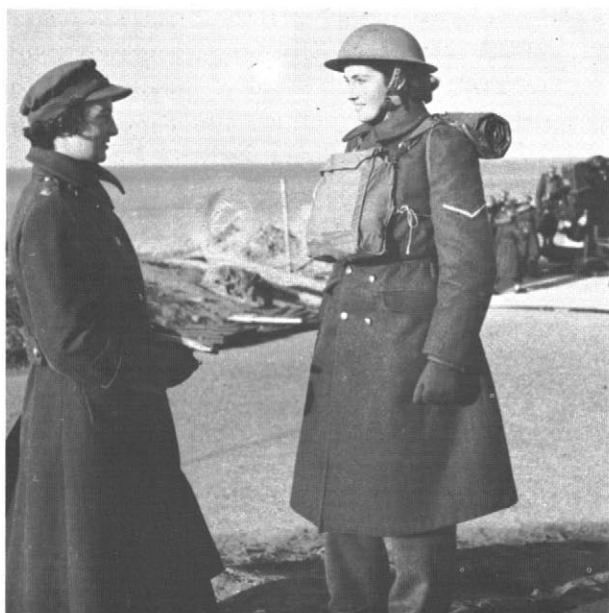
ATS subaltern—note 'pip' on greatcoat shoulder-strap—and lance-corporal on an Anti-Aircraft Command gun site, probably winter 1941. The helmeted girl wears her greatcoat over a battledress blouse and slacks.

year. A further 85,000 were required to increase the aircraft building programme. Consequently, on 2 December 1941, the War Cabinet announced the conscription of women, a step not systematically adopted by any other combatant power. The National Service Act made liable for compulsory service all unmarried women and childless widows. At first only those between the ages of 20 and 25 were called up; the limit was later dropped to nineteen, and could be extended to 30 if required. The Act made women eligible for all the traditional male decorations for service and valour, up to and including the Victoria Cross. Born of dire national need, this Act was to prove in the long run another huge step forward along the path of emancipation, and was a logical sequel to the previous Direction of Labour Act, 'conscripting' personnel into war industries.