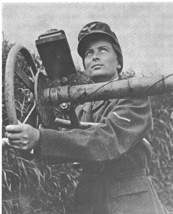
Flakwaffenhelferin, 1944, manning a searchlight battery. The cap, jacket and thin sleeve chevron of grade can all be seen.