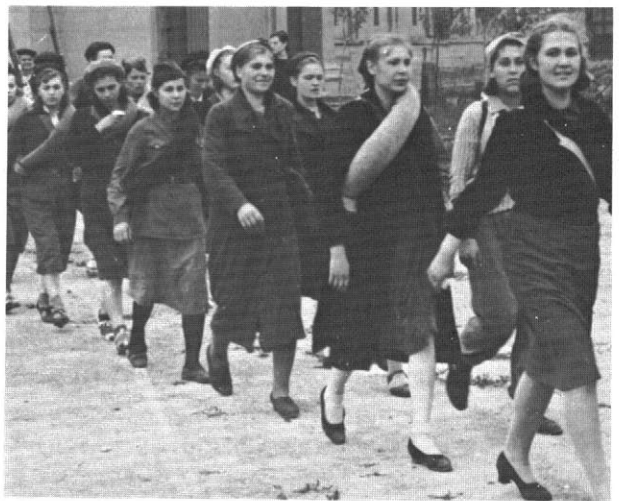
Moscow women undergoing training in reserve formations —local militias, known as apolchenie or DNO units. They wear an assortment of military and civilian dress and rudimentary equipment; some at the rear of this column carry the old 7.62mm Moysin-Nagant rifle.

Russian tank crews were recruited initially from men with experience of driving and maintaining trucks and agricultural tractors, and who thus did not have to be trained absolutely from scratch. The hideous losses suffered by the armoured troops in 1941 and 1942 depleted this pool of semi-trained men; and in 1943 women began to arrive at the front as drivers in tank brigades. They had already played an important rôle behind the lines as test drivers and delivery crews at the tank factories and railheads; this experience in fact