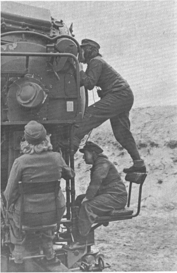
Group of Flakwaffenhelferinnen on searchlight battery duty, 1944; note slacks tucked into socks and heavy laced shoes.

At the end of the war it was decided that the final barriers must be swept away, and that the women of the Kriegshilfsdienst Luftwaffeneinsatz must take over direct military duties from male soldiers. In November 1944 the women who had already volunteered for a limited service period were compulsorily conscripted to serve for the duration of the war; their 'head start' in training made them more valuable than the newly conscripted women. In all, the compulsory call-up of women for the Luftwaffeneinsatz brought in between 300,000 and 350,000; the high proportion of college students in this group, as well as the core of trained 'volunteers', considerably eased one problem which had dogged the Kriegshilfsdienst, and which would seem inseparable from the chaotic lack of co-ordination in mobilizing women's services which characterized the Ger-