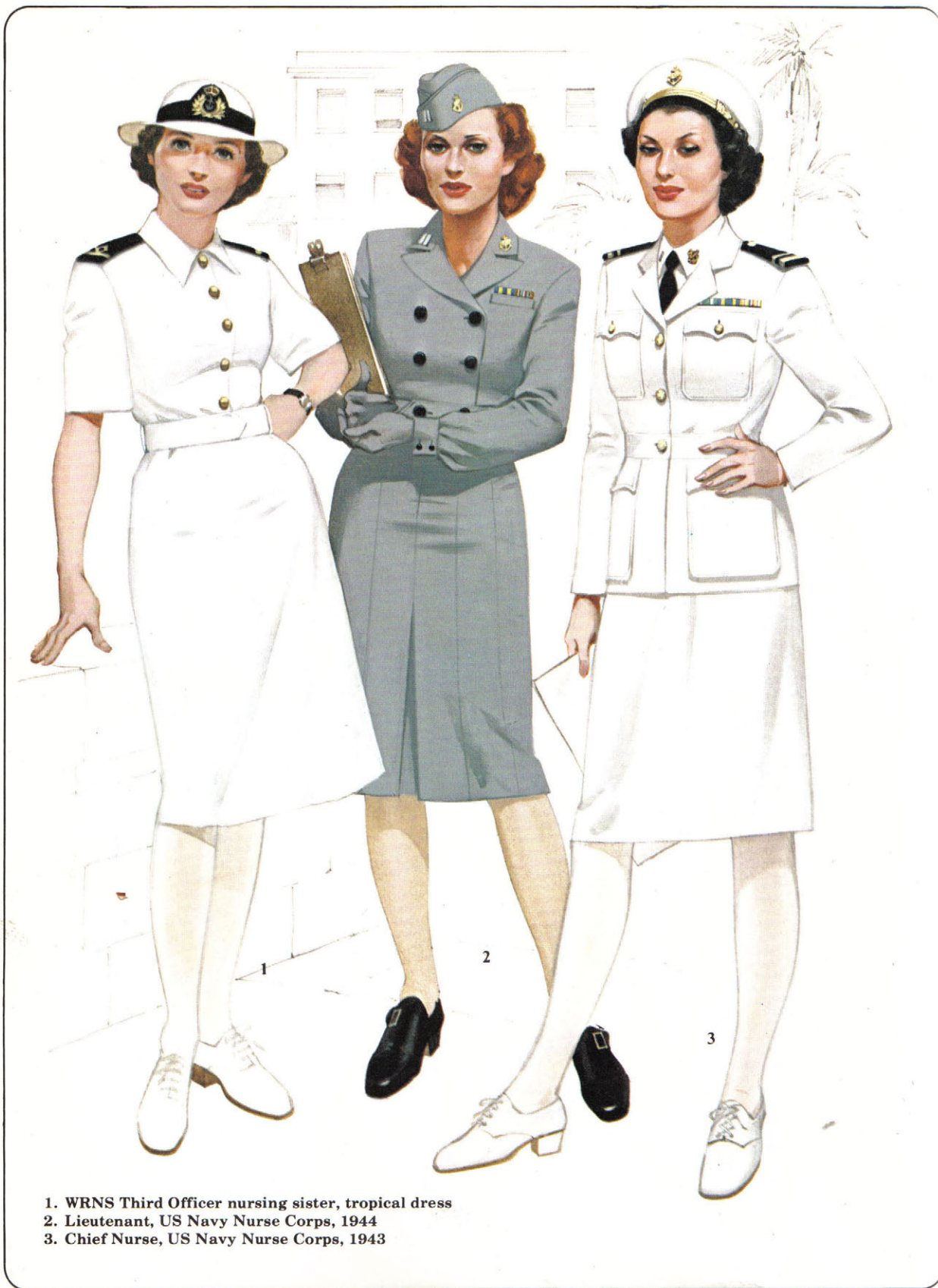
1. WRNS Third Officer nursing sister, tropical dress 2. Lieutenant, US Navy Nurse Corps, 1944 3. Chief Nurse, US Navy Nurse Corps, 1943