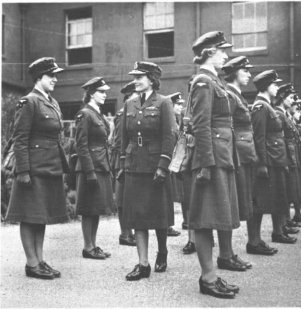
Above Parade of WAAFs under inspection by the late Duchess of Gloucester, showing the differences between the uniforms of other ranks and an officer of air rank.

generally smarter and better fitting, with a Sam Browne belt. More than 8,000 FANYs served in a total of 22 countries during and after the war.