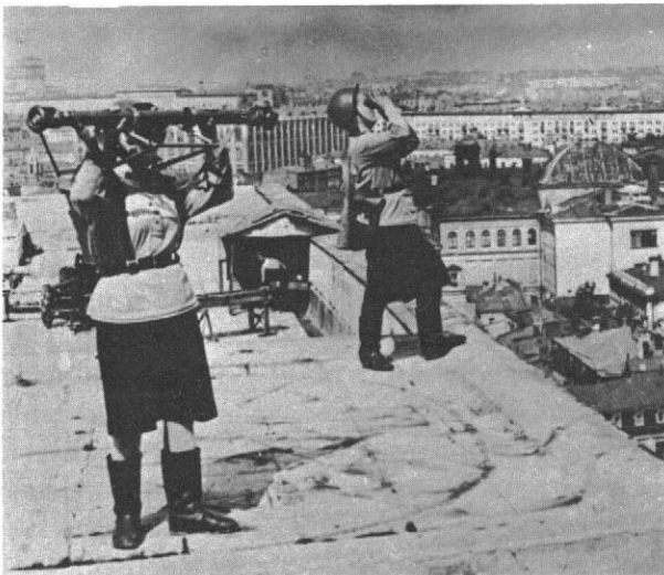
Anti-aircraft spotters on a Moscow rooftop, 1943, wearing 1940 steel helmets, stand-collar shirt-tunics in khaki, and dark blue skirts.

G3: Italy: Auxiliary, MVSN 'Aldo Resega' Brigade This female auxiliary of the Fascist 'Blackshirt' organization, the MVSN, wears an all-black uniform. The large beret bears a gold fasces badge, repeated on the turned-down, rounded points of the blouse collar. The pocket flaps are straight here—for officers they were three-pointed. Wool socks and heavy mountain boots are worn