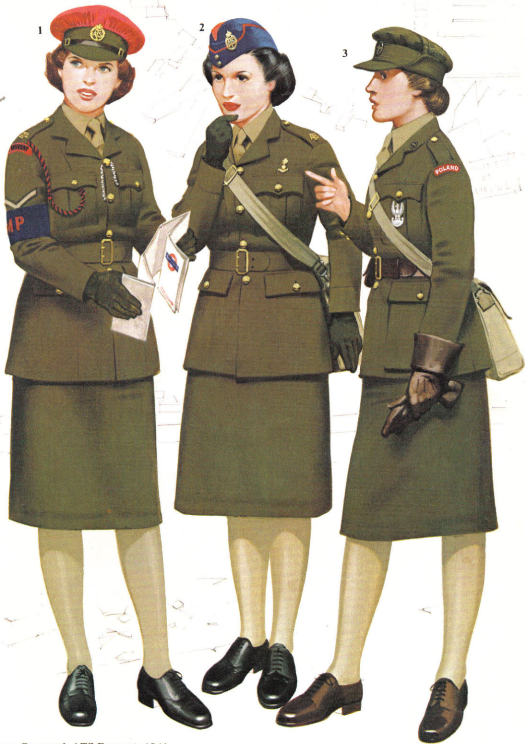
1. Lance Corporal, ATS Provost, 1941 2. ATS Private, attached Royal Artillery, 1941 3. Polish ATS Driver, Ambulance Car Company