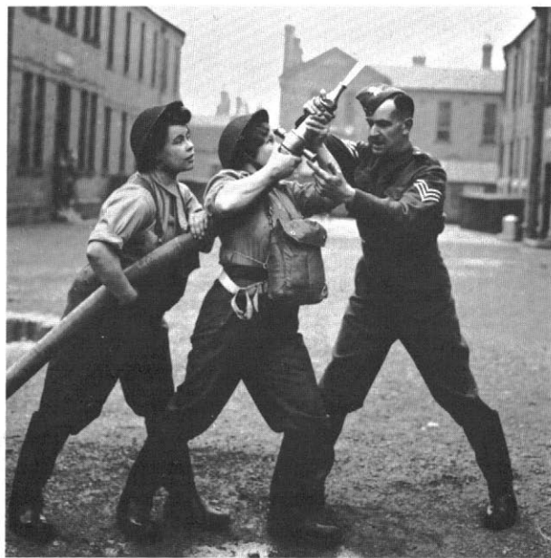
and not so traditional. ATS girls are trained as firefighters, dressed in steel helmets, light khaki shirts and ties, and khaki slacks with wellington boots. The gasmask is slung ready for use, as always.