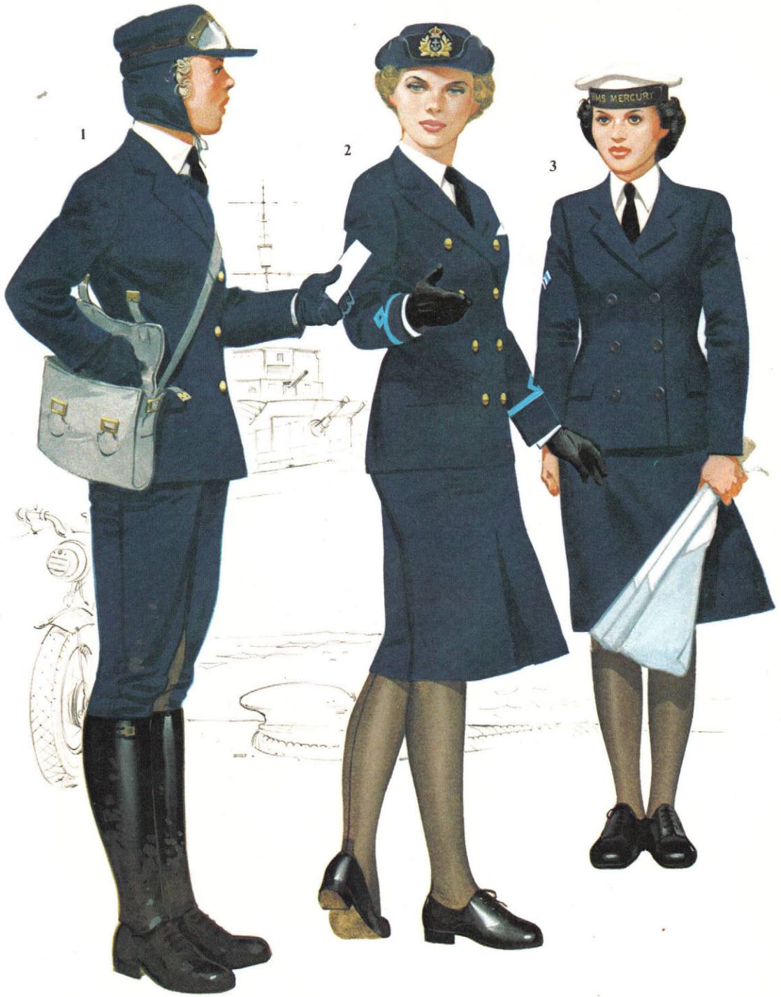
1. WRNS Despatch Rider 2. WRNS Third Officer 3. WRNS Signals Rating