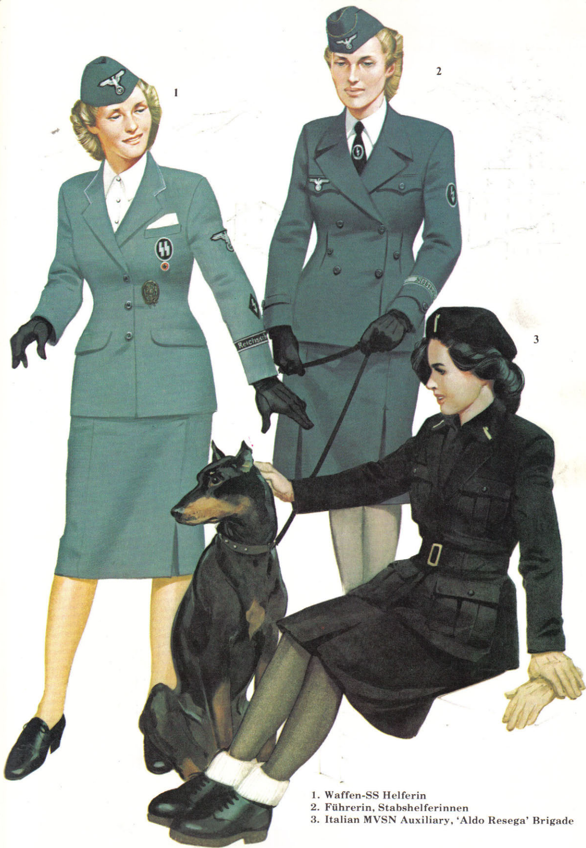
1. Waffen-SS Helferin 2. Führerin, Stabshelferinnen 3. Italian MVSN Auxiliary, 'Aldo Resega' Brigade