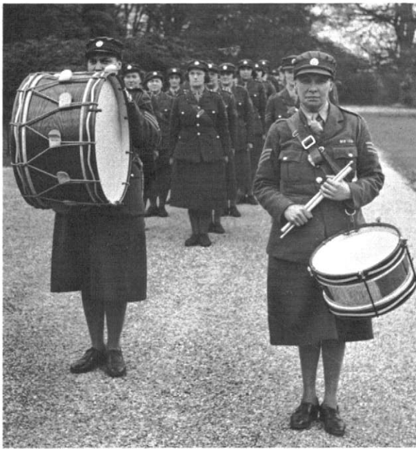
The ATS Band in its early stages; by May 1942 a corps of drums under a drum-major had been approved, and in April 1944 the band was recognized as a regular army band.

field of living conditions; much of the bad management which had led to unsatisfactory conditions was soon rectified. In February 1942 a Directorate of Public Relations was formed to deal with ATS affairs, with PR officers in each army command. Special recruiting platoons and mobile exhibition platoons were set up to tour the country, and a band was formed as part of this public relations exercise, with a corps of drums under an ATS Drum-Major.