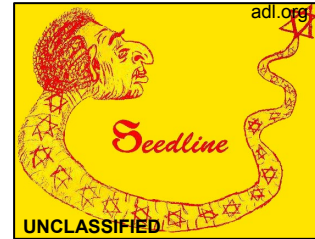
(U) Christian Identity symbol.

(U) Christian Identity (U//FOUO) A racist religious philosophy that maintains non-Jewish whites are “God’s Chosen People” and the true descendants of the Twelve Tribes of Israel.