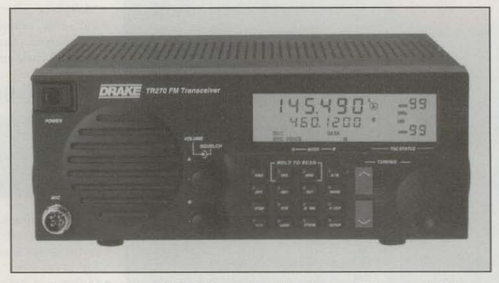
Front view of R.L. Drake's TR270 gives only a hint of its special features. Unit is comparable to a six foot rack of communications gear.

*4941 Scenic View Drive, Birmingham, AL 35210