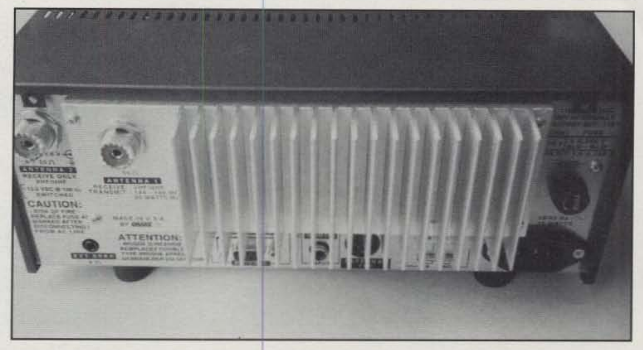
Rear view of the TR270 reveals massive heatsink, dual antenna sockets, and ports for computer interfaces.

Getting behind the controls of a TR270 is like turning a kid loose in a candy store. It's difficult to choose what to pursue first! Let's scan some of the public-service and marine channels and try the orbiting 2 meter FM repeater satellite. Wait-let's set the TR270 scanning the 137 MHz range and cable its DEMOD out to our computer for viewing weather pictures. Shall we use the rig to chat with the local repeater gang, or set it up to be a re peater? How about packeting via OSCAR today and copying some HF fax tonight? Whoa, Dave-slow down! Okay, the TR270 is very easy to use and everyone complimented its terrific audio. Using the rig for local repeater chats, however, seems like driving a Rolls Royce to the corner store. There are enough features, frills, and special assets in this gem to captivate your interest for many years.