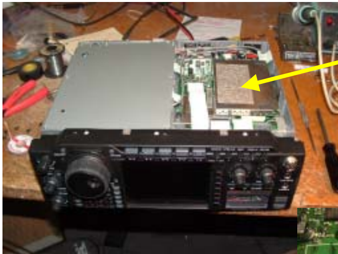
Picture 1. DSP unit. Unplug and set aside.

Observe control unit on right side with plug-in DSP unit. Carefully unplug DSP unit and set aside (see orientation picture 1.)