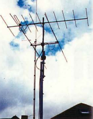
The antennas used by GORSN when operating

Thanks for the loan of the review IC-910H go to Icom (UK) Ltd., Sea Street, Herne Bay, Kent CT6 8LD. Tel: (01227) 741741.