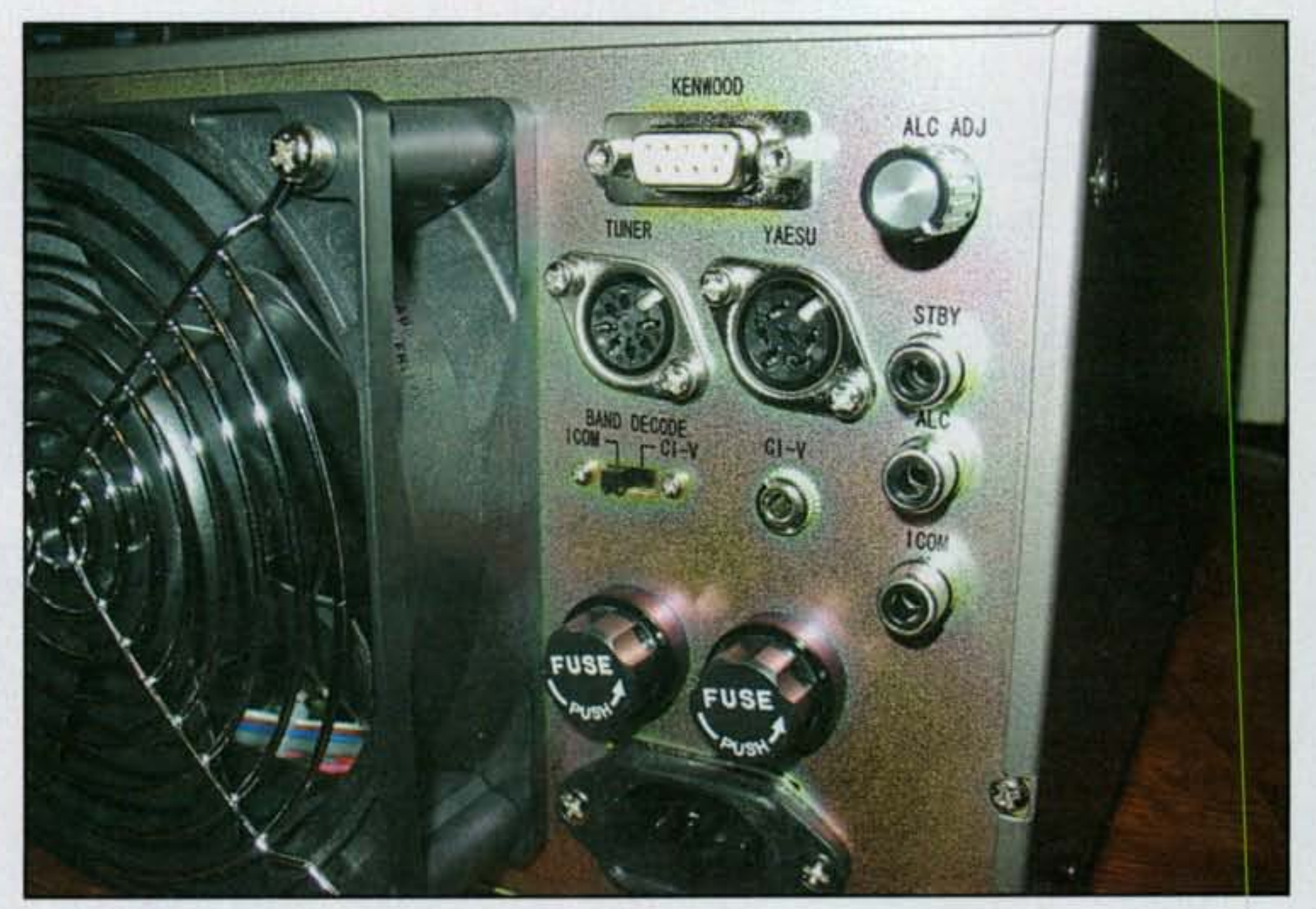
Photo D-Close-up of the well-marked transceiver interface connectors. All cables are supplied for directly interfacing band-data information from many ICOM, Kenwood, and Yaesu transceivers.

Connecting the HL-1.5KFX is easy, although it may not always be a trivial