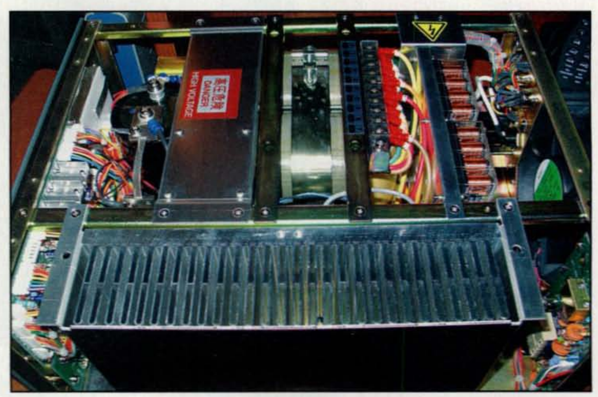
Photo B- Inside view of the amplifier. Note the massive heatsink in the foreground.

tial final-damaging incidents. When the protection circuits operate, they cause the amplifier to go off-line. There are five major protection circuits built in, all of which have front-panel indicators. These include Over Drive for when drive power exceeds 100 watts, Over