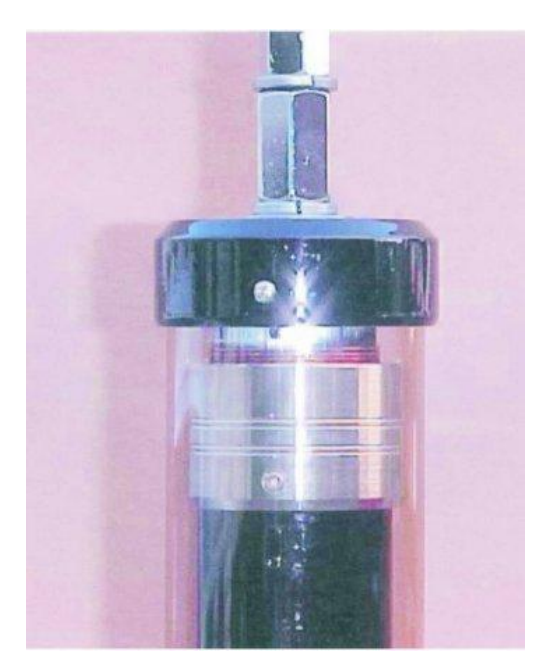
Little Tarheel II in 10 meter position with 32" whip