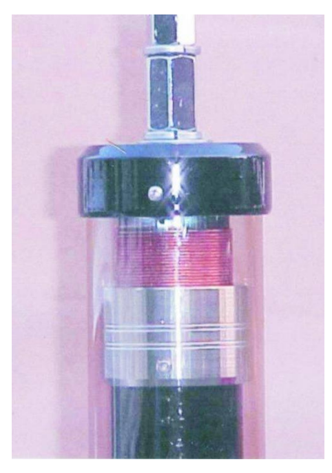
Little Tarheel II in 20 meter position with 32" whip