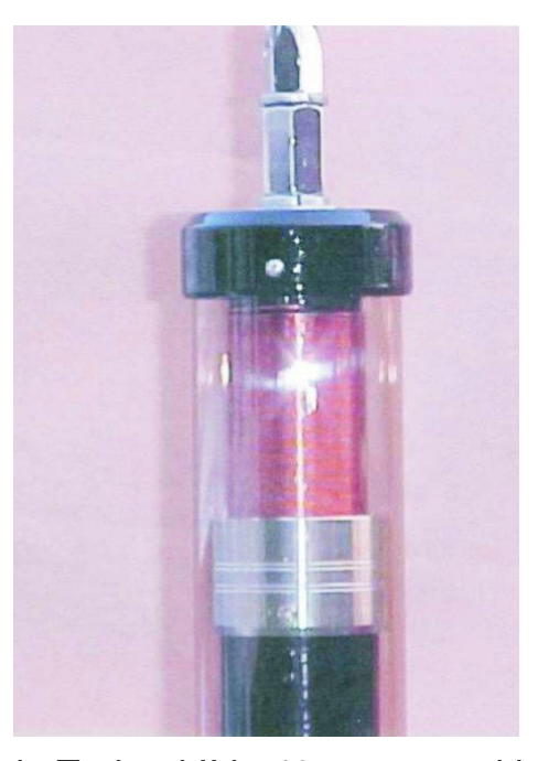
Little Tarheel II in 40 meter position with 32" whip