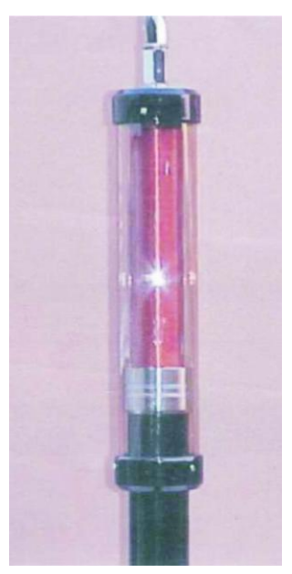
Little Tarheel II in 80 meter position with 32" whip