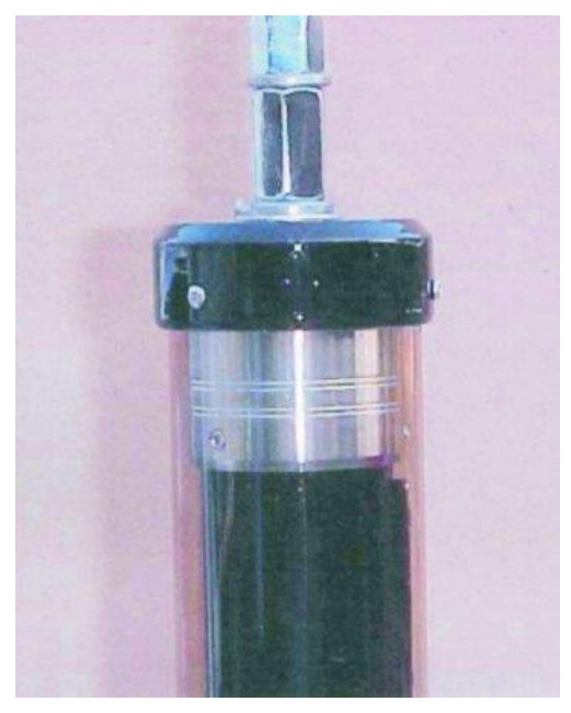
Little Tarheel II in 6 meter position with 32" whip

The following photos will show you relative tuning positions of the Little Tarheel II antenna.