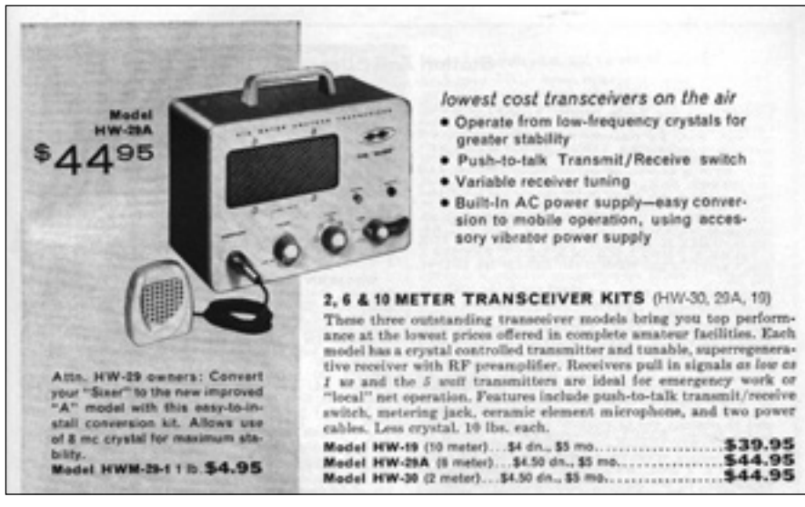
A Heathkit Twoer advertisement from the December 1960 issue of QST.

crystal frequency to 24 MHz, then tripled it again to 72 MHz and finally doubled it to 144 MHz where it went "straight through" the final amplifier, a 6AQ5 power pentode that ran "approximately 5 watts," according to the manual. The 6AQ5 also served as the audio power amplifier for the receiver. The Twoer used plate modulated AM with good quality audio. It could also run CW, more or less, but the manual cautioned that there would be "considerable back wave that may result due to the fact that the previous transmitter states are running constantly." I tried CW a couple of times and the other stations could hear the transmitter even when it was not keyed!