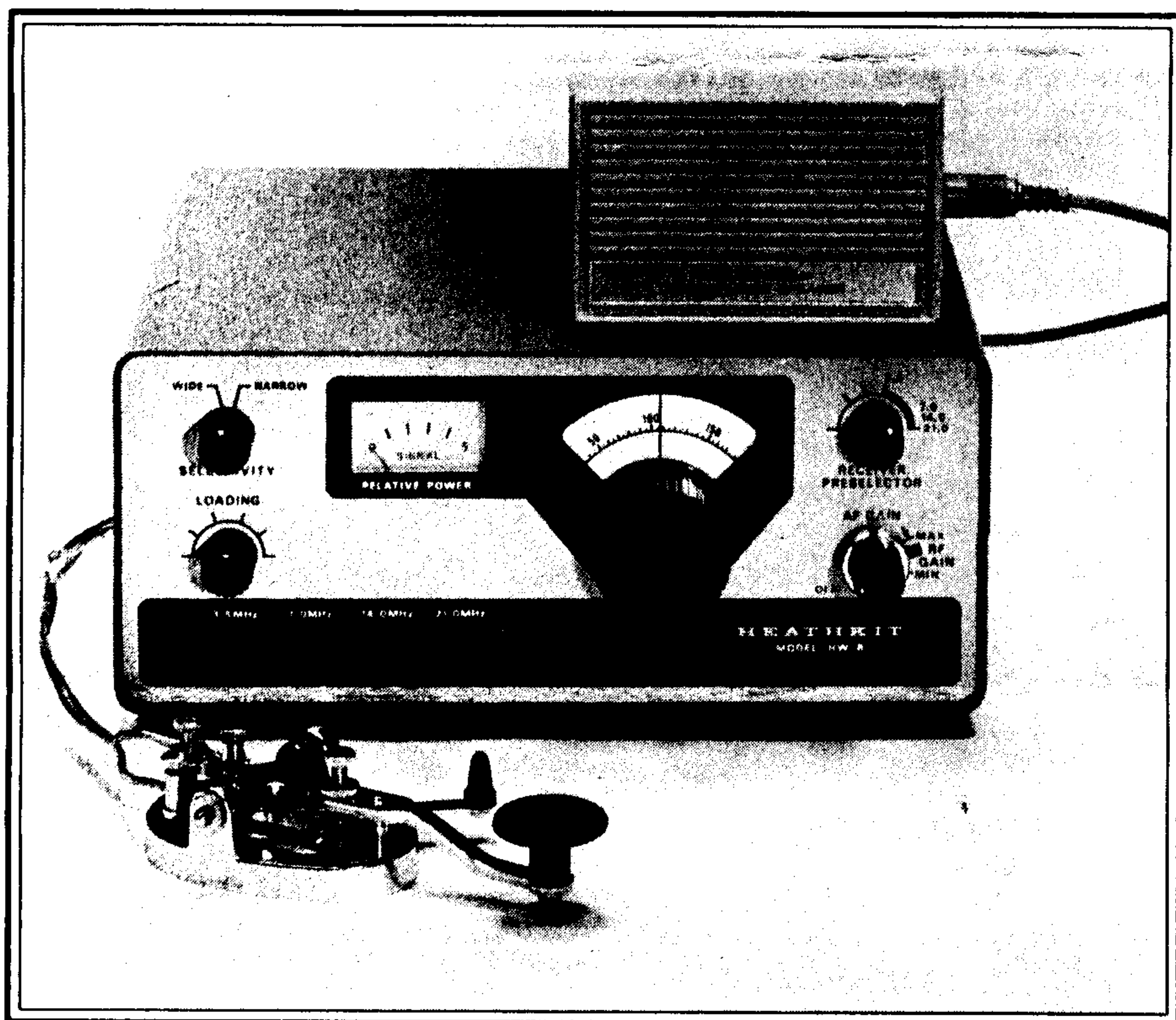
The Archer Mini-Amplifier/Speaker simply plugs into your HW-8 to give you an instant speaker.

H eathkit's HW-8 is perhaps one of the most enjoyable pieces of amateur gear I have had since my Novice station, which consisted of a home-brew transmitter and Heathkit AR-3 receiver. The little rig combines effective simplicity with the kind of compact portability that has always delighted me. It seems equally at home in the Novice shack as well as in that of the seasoned QRP "pro."