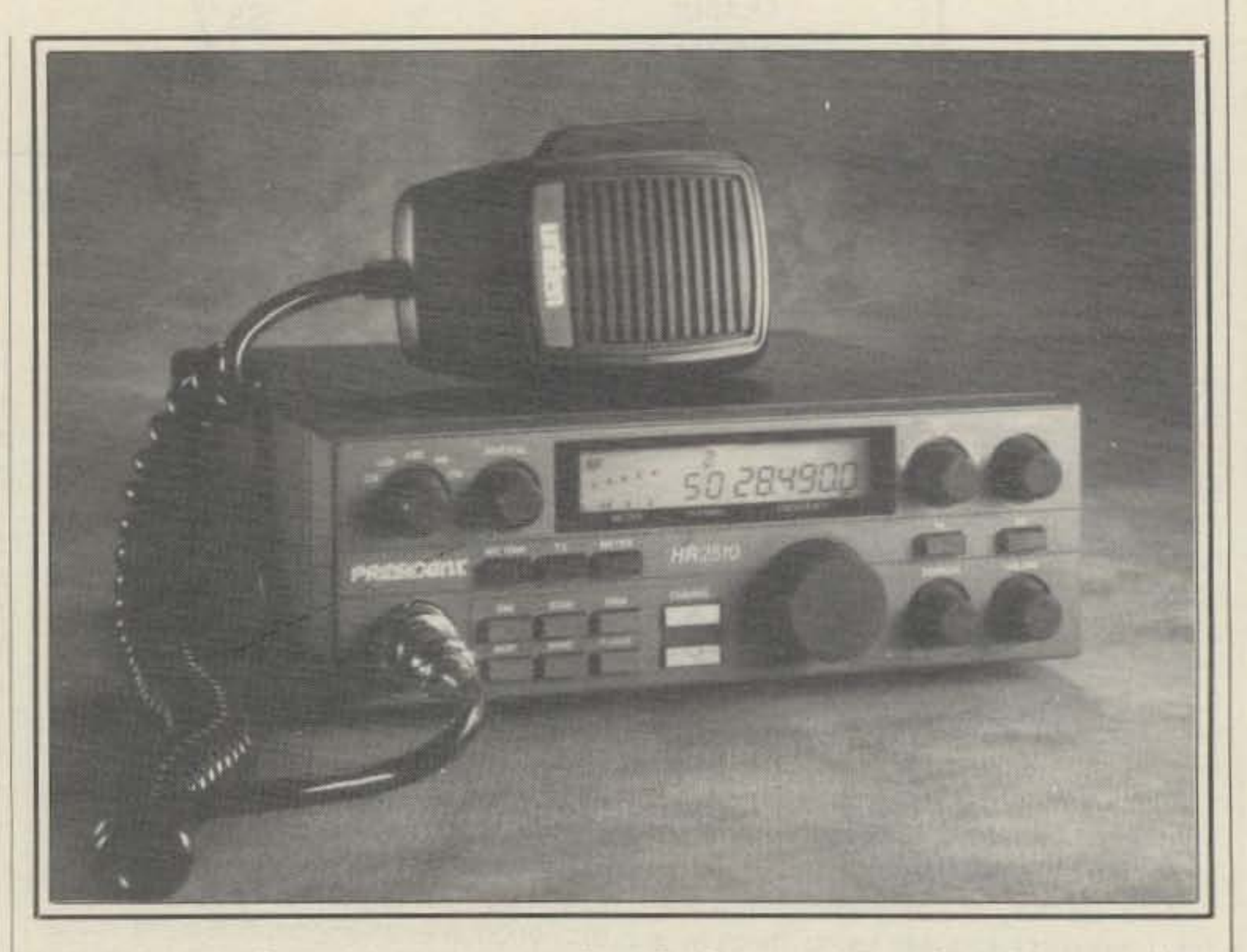
Uniden's new HR-2510 is a compact, all-mode 10 meter transceiver with a sensitive receiver and 25 watt output transmitter.

involves replacing one "accessory" plug with another (supplied) plug wired to your speaker and/or key.