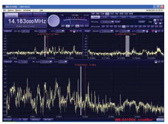
PHOTO 3: The control panel continuously displays three spectrum scans.

on the filter length and are given in Table 2 for the default setting of 200 and maximum length 5000 with the 2.4kHz bandwidth filter.