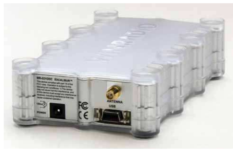
PHOTO 1: The Excalibur receiver hardware is contained in a small shielded box inside a clear plastic case.

INTRODUCTION. WiNRADiO have been developing and manufacturing PC controlled receivers and receiver systems since 1996. An Australian company supplying professional, government and hobby markets, they have an extensive product range and are one of the leaders in software defined receivers. Their latest model is the WR-G31DDC Excalibur, a direct digital sampling receiver for use up to 50MHz. Boasting a high performance specification, I was keen to check it out to see how well it performed.