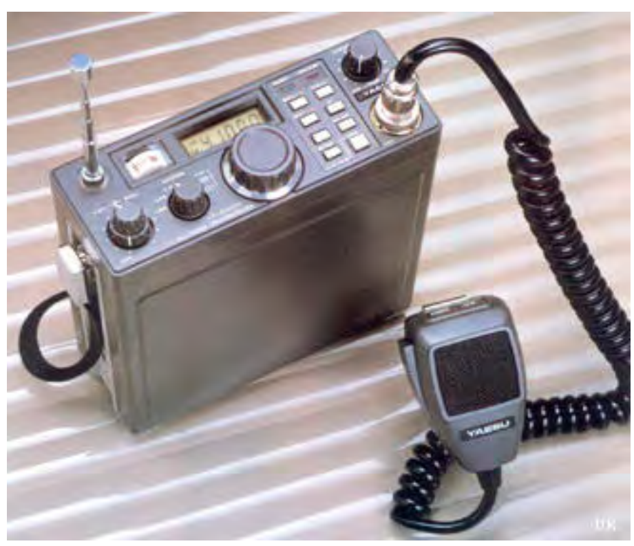
Fig. 1: The Yaesu FT-290 Mk1.

This month Chris Lorek G4HCL revisits the hugely popular Yaesu FT-290R Mk1 2m multimode transceiver.