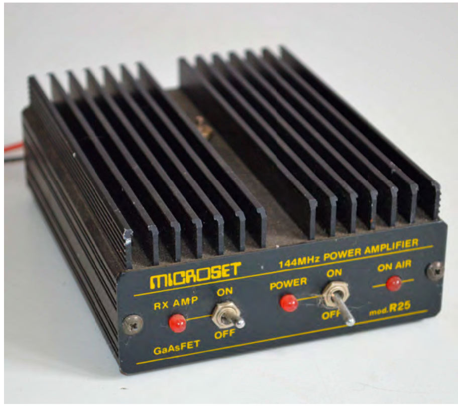
Fig. 3: The Microset 2m 30W in-line linear amplifier and receive preamplifier.