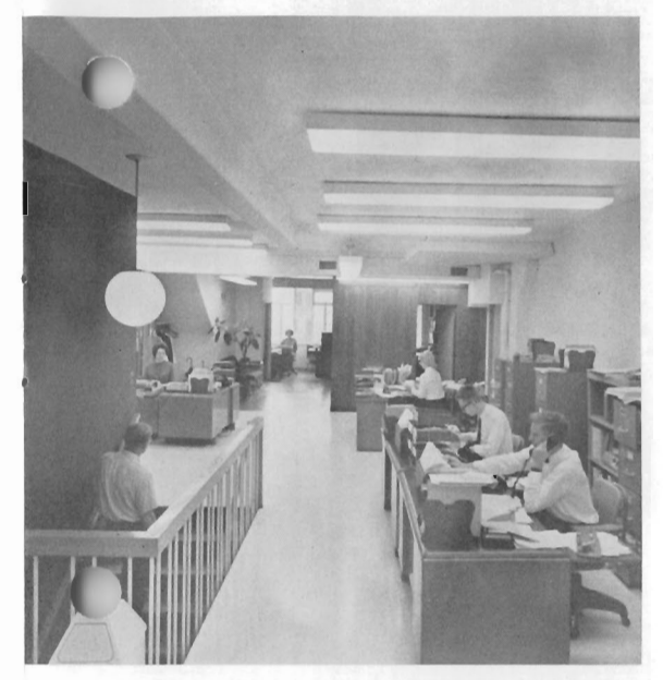
Behind RMC's facade on East 75th is one of the most modern and well-equipped sales offices in the electronic industry. The division occupies two buildings totaling 10,000 square feet.