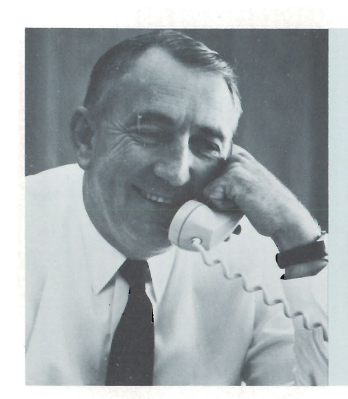
from our president's desk

NE OF THE MOST important, and most difficult, problems in guiding the course of our company is to predict the rate of incoming orders and to gear our production accordingly. Our products are all standard models, listed in our catalog, and our customers expect us to be able to deliver them without delay. This is no small task, since it requires several months to order the parts, fabricate the materials, and assemble and test a production quantity of instruments. Furthermore, because we have hundreds of different instruments, we have to fit them all into a complex production schedule.