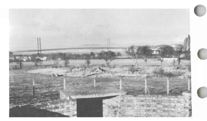
View from plant site overlooking Firth of Forth, and bridge which bears striking resemblance to Golden Gate. WW II gun emplacement, center foreground, protected vailroad bridge out of photo to right.

Phil Towle, corporate plant engineering manager, recently returned from an inspection of the area with much praise for the site location, the Scottish people, and the living facilities available to employees at the plant. A park and new school are planned for property located next to the site.