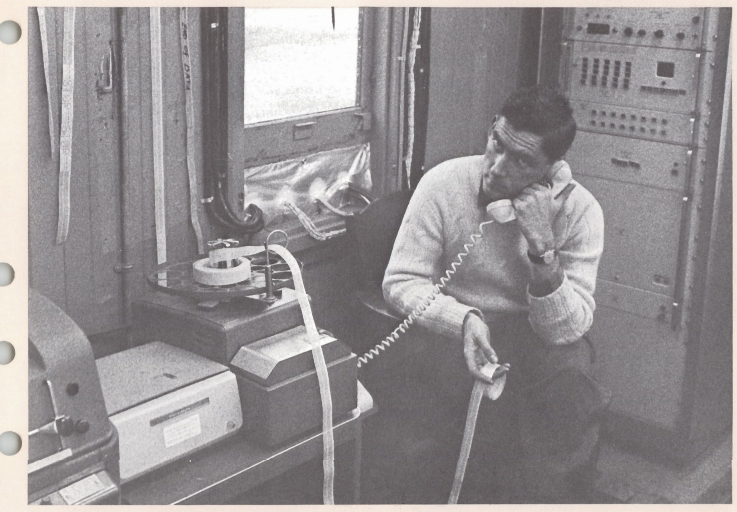
Eight-level tape from the Dymec 2010B system was transmitted 800 miles to Montreal where identical tape was produced and fed into computer.

Each day during the experiment, as the Dymec system punched out the information on 8-level tape, it was transmitted 800 miles to Montreal by long-distance telephone on equipment which could switch from voice messages to data pulses. There, at the Institute's Pointe Claire headquarters, an identical tape was punched out and fed into a computer.