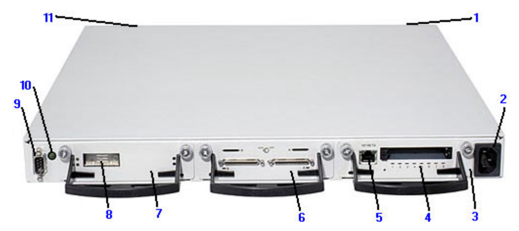
Figure 2: Modular Data Router component identification

The Modular Data Router is a main component of the Switched Fabric Fibre Channel environment.