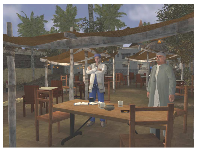
Figure 1: SASO-EN Scenario

In the course of the interaction, the human trainee must negotiate with the virtual characters, establishing trust and satisfying the objections of the doctor and elder to moving the clinic. The virtual humans evaluate the utterances made by the trainee and each other, update their models of the conversational states and models of each other, and plan how to react and what to do next.