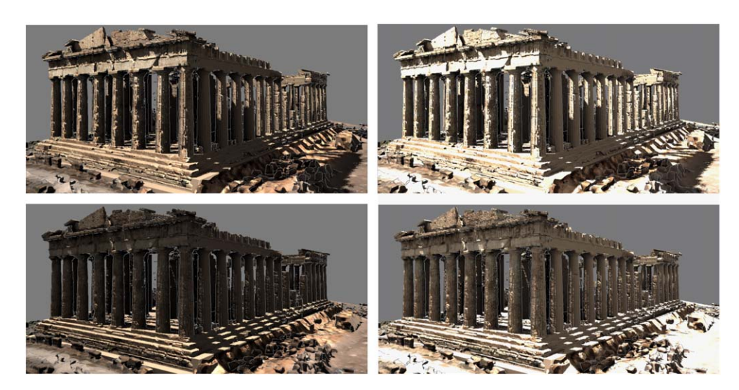
Fig. 2. Examples of realtime shading: note how the shadows moves precisely over the geometry (top-let and bottom-left images) and how the HDR lighting calculation allows to adjust the exposure to better perceive details (images on the right) which are under shadows in the images on the left.