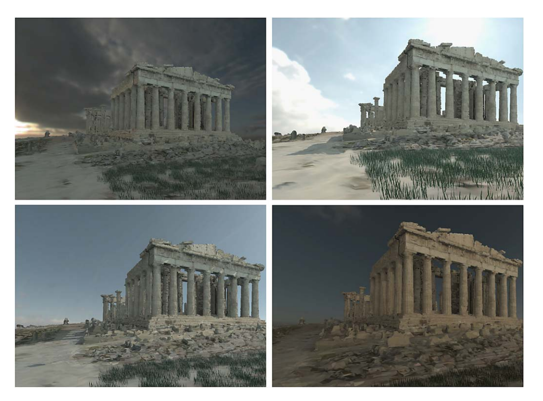
Fig. 6. Screenshots of the realtime demo. Time flows from dawn to dusk, shadows moves across the building and the overall hue of the scene changes according to the sky illumination. The shots are taken from different positions, each time nearer to the building.

this computation has been integrated inside an existing application framework. Since the techniques used in the demo are quite general, the same kind of computation could be integrated in other existing visualization systems. Having all the calculation done on hardware shaders of modern GPU, it is viable to extend existing rendering engine to accommodate additional data and shader management. This way it would be possible to add realistic lighting even to large 3D dataset visualization tools.