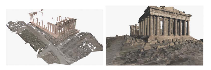
Fig. 5. The 3D model after reduction and culling; even if the model is not complete (left) it contains all the elements visible from the FlatWorld environment (right).

At this point we had a simplified model, however, this model still had too much geometry (2 million triangles) to be suitable for our realtime application. By exploiting the characteristics of our constrained virtual window system (the model will be viewed from a virtual window and with a freedom of movements of a few cubic meters) we further reduced the size of the geometry by purging those model