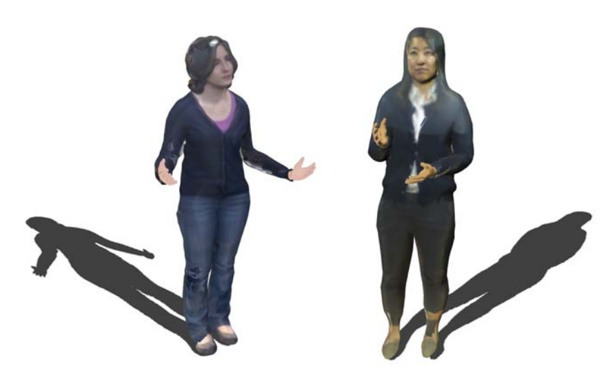
Figure 1: We present a system whereby a human subject can be efficiently captured and simulated as a 3D avatar. We present a study where we ask subjects to judge which performance better resembles the person depicted in the avatar.

<sup>1</sup>Institute for Creative Technologies, University of Southern California <sup>2</sup>Northeastern University