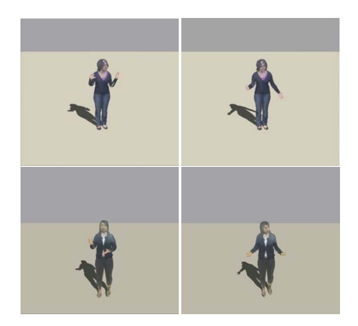
Figure 4: 3D avatars captured with gestures synthesized by our system. Each avatar performance is synthesized with the original subject's gestures and with the other's gestures.

Among participants who knew actress B, we find comparable results for her avatar. Participants reported that the avatar was 'more like her' when it gestured like actress B (Median = 5.00, IQR =