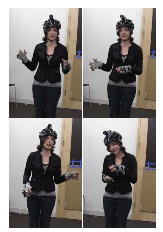
Figure 3: Performance capture of the actress using markerless motion capture. Additional head and wrist sensors are added to supplement the

The advantage of the method is that it separates the gesture label inference from animation synthesis, and thus the two learning tasks can be solved individually with different datasets. This allows us to easily use the gesture motion from a particular individual to as input motions to specifically encode his gesture styles. Since the method does not require the input motion to be a structured set of gestures, the raw captured gesture motions can be readily used as input to build the GPLVM without further processing. Thus the synthesis method fits well with our rapid avatar capture pipeline to further obtain and inject the styles of movements onto the captured avatars.