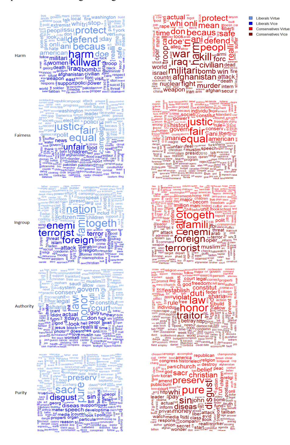
Figure 3: Topic Clusters emerged using the seed words