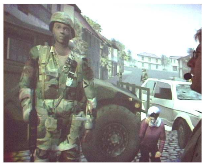
Figure 1: Interaction between the trainee and autonomous characters in the Mission Rehearsal Exercise

ual's perspective is frequently biased or misleading. For example, what seems like a bad decision from the perspective of a subordinate might make more sense if he were placed in his commander's shoes. By collectively discussing events after the fact, decision makers can come to a truer understanding of who did what, why, and how they can do better the next time.