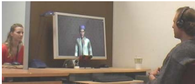
Fig. 3. Experimental setup

The Listener (left) sees a video image of the Speaker (right). The Speaker sees an Avatar allegedly displaying the Listener's movements. Stereo cameras are installed in front of both participants (Listener data is ignored but stored for data collection/analysis).