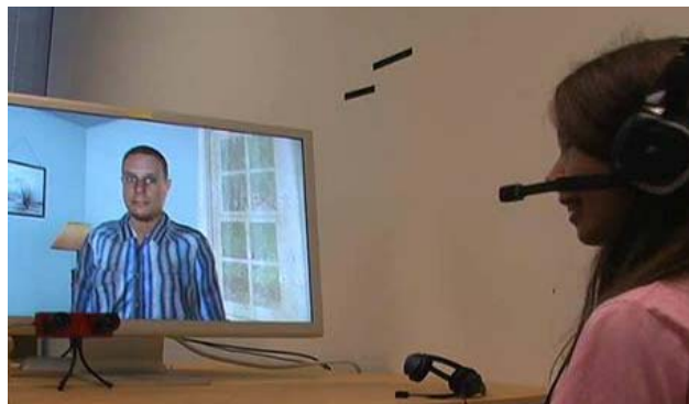
Fig. 1. A child telling a story to the RAPPOR AGENT

The RAPPOR AGENT (Figure 1) was designed to establish a sense of rapport with a human participant in “face-to-face monologs” where a human participant tells a story to a silent but attentive listener (Gratch et al., 2006). In such settings, human listeners can indicate rapport through a variety of nonverbal signals (e.g., nodding, postural mirroring, etc.) The RAPPOR AGENT attempts to replicate