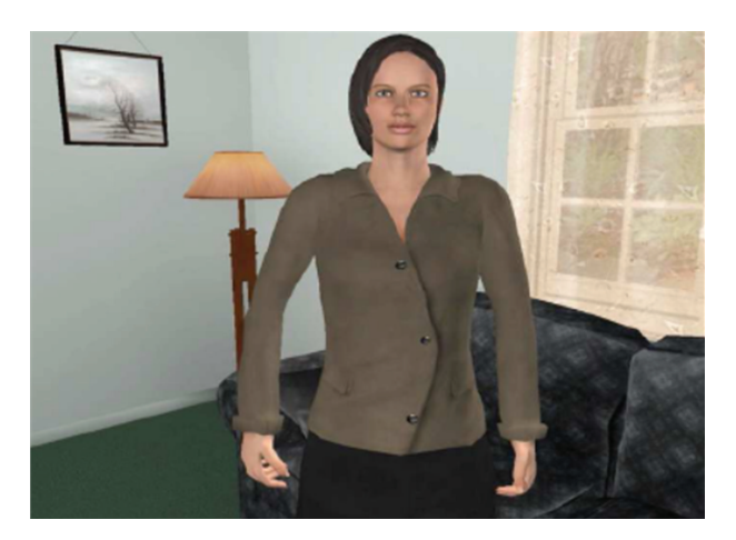
FIGURE 3: Female rapport agent.

image-based tracking library developed by Morency et al. [35], uses images captured by the stereo camera to track the participant's head position and orientation. Acoustic features are derived from properties of the pitch and intensity of the speech signal using a signal processing package, LAUN, developed by Grath et al. [16]. The Rapport Agent displays behaviors that show that the animated character is "alive" (eye blinking, breathing) and listening behaviors such as posture shifts and head nods are automatically triggered by the system corresponding to participants' verbal and nonverbal behavior. A female virtual character was used for this experiment (Figure 3).