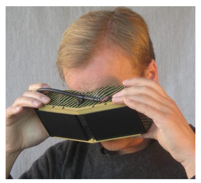
Figure 1: Wide5 Head Mounted Display with a 150 degree field of view.

A variety of hardware has been devised to allow free locomotion while confining the user to a small area. These include omni-directional treadmills, unicycles, and large "hamster balls" within which users can walk or run [Darken1997,