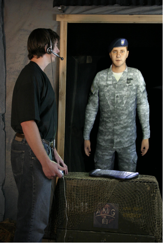
Figure 3: SGT Star, a virtual human presented on a trans-screen

Employing wide field of view displays like one of the new generation of wide HMDs (providing up to 150 degrees), the lab is exploring the ability to create uniquely compelling experiences with virtual humans. Peripheral vision cues, previously unavailable using standard HMDs, engender a variety of spatial cognition and pre-attentive behaviors that appear to be important in engaging users into a situation. Some photographers anecdotally mention that they feel as if they are detached observers of real world events. While some of that disengagement comes from their journalistic role, perhaps the limited field of view of a camera lens may play a part by lessening the immersion that photographers feel with the real world. This line of thought leads to questioning if a narrow field of view HMD could limit the sense of presence of virtual characters.