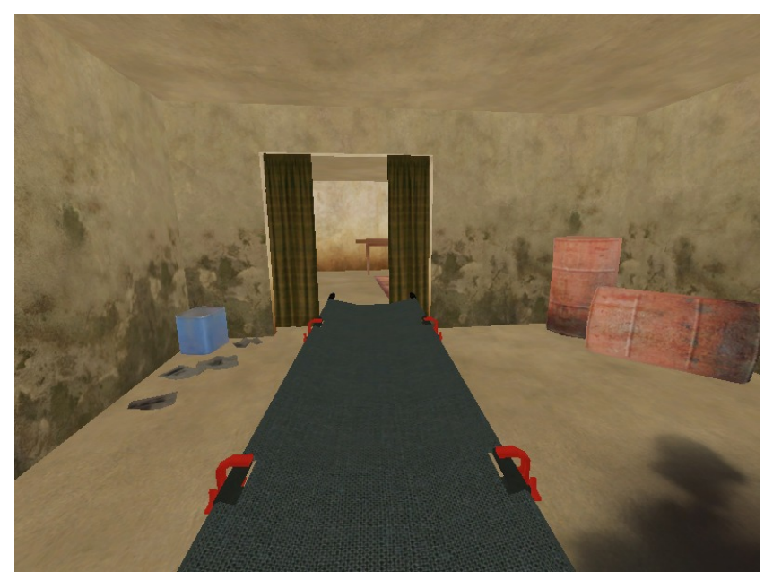
Figure 2: Force sensitive cart compresses space in this gurney scenario.