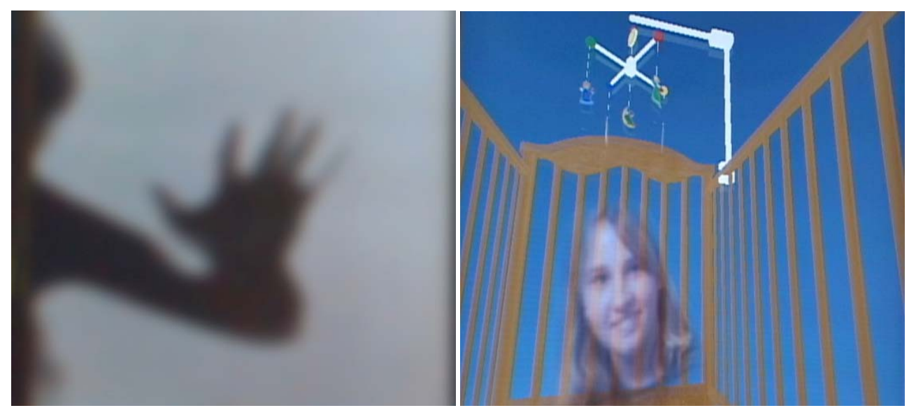
Figures 5 & 6: Two images from my 2007 Memory Stairs that take the embryonic chamber metaphor literally.

Even though we may not fully know why women tend to approach Virtual Environment art from a different mental state – it seems that numbers bear some support for the arguments mentioned above. As mentioned previously, in 2007, I compiled an exhaustive listing of all the immersive VR artworks I could find that had been created from the earliest days (not only including Jaron Lanier but even back to Myron Krueger's 1975 VideoPlace , executed long before such immersive work was known by the name VR). While the chart itself can be found online, there are some necessary explanations about it that will be presented next.