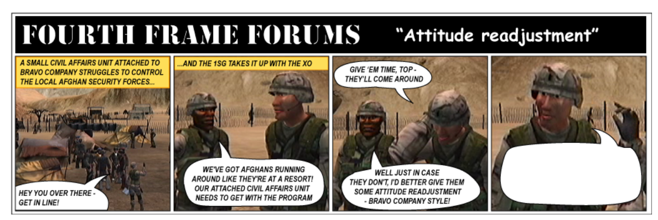
Figure 2. An example Fourth Frame Forum episode

The final step in authoring an episode was to realize the episode description as a four frame graphical comic using the conventions of the genre [7]. Artistically inclined developers may choose to hand-draw the episodes in the traditional manner of comic strip creation, whereas others may find it easier to start with photographs of posed character models that can be edited using commercial drawing applications. In developing four example Fourth Frame Forum episodes in support of US Army leadership development, we chose to start with single frames of a series of machinima-style cut-scene videos of 3D virtual characters taken from an existing training application [3]. Individual video frames were selected that approximated the intended descriptions of each comic frame, cropped to focus on the relevant characters and