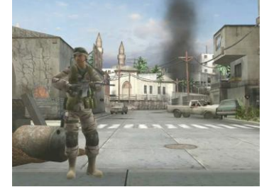
Figure 1. Sample scene from "Virtual Iraq"

(danger cue, AX), and a different pattern of colored shapes heralding no ensuing airblast (safety cue, BX). There were 3 blocks with 12 trials (4 AX, 4 BX) in each block [16]. The second psychophysiological assessment featured three 2-minute sequences in a highly realistic Virtual Iraq environment. Two of the sequences represent a perspective from a HUMVEE in a convoy that is confronted with improvised explosive devices (IEDs) and ambushes. The third sequence involves a foot patrol that proceeds through a village marketplace where there are explosions and terrorists firing rocket-propelled grenades (Figure 1).