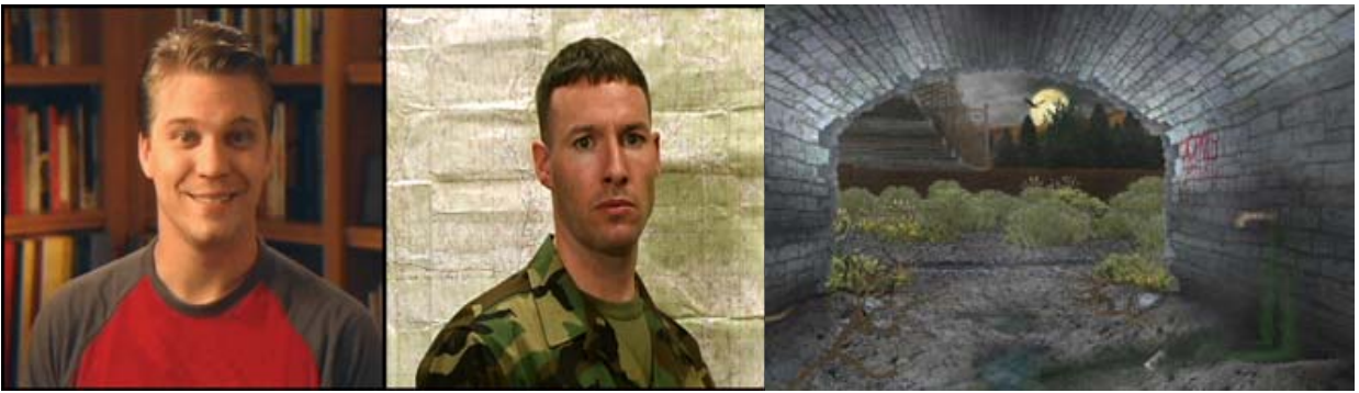
Figure 1: Priming is delivered by themed characters