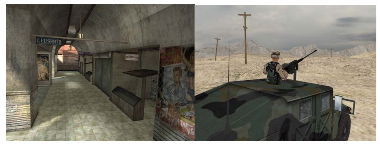
Figure 5. Interior View