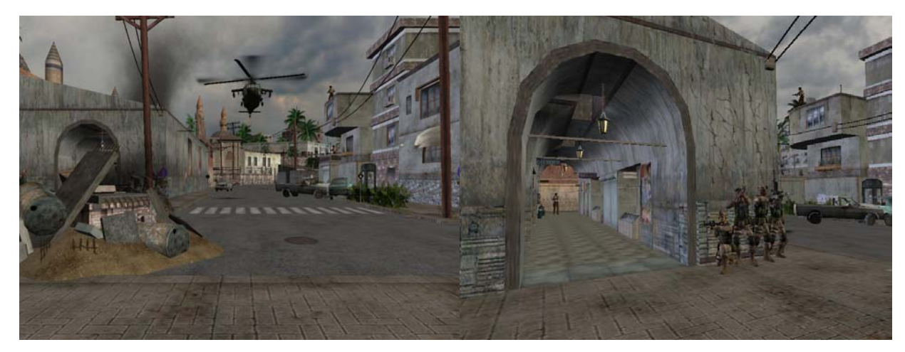
Figure 3. City View