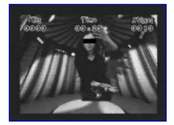
FIG. 4. Screen shot of the juggler application.

ducing an intervention tool of greater power and flexibility. Our main challenges stem from two constraints. First we wish to maintain the advantages of video capture VE, namely unencumbered and patient-friendly operation. We also want the system to be moderately priced and affordable for clinicians. These constraints have led us to implement the haptic feedback vibratory discs, delivering haptic-tactile vibratory stimuli. The system appears to be feasible for testing the relevance and contribution of the different feedback modes. In the next phase, we will apply the system to various patient populations, who may react differently to the various feedback combinations. Our ongoing experimental work will help to determine how realistic such stimuli will appear to both abled-bodied and patient subjects.