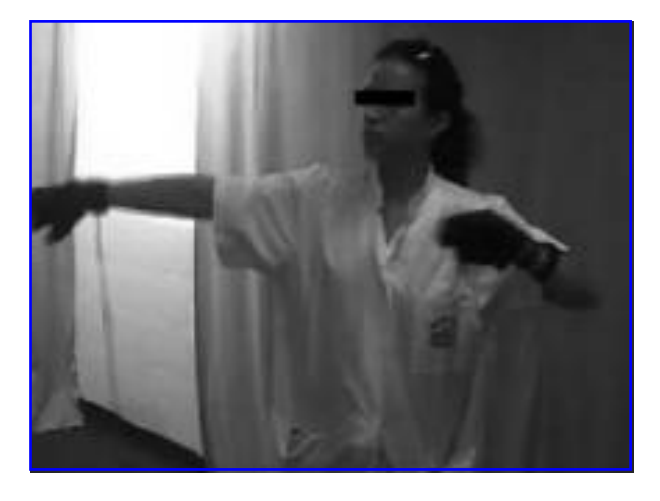
FIG. 3. Subject wearing two red gloves with embedded vibrators on palmar surface and heart rate monitor.