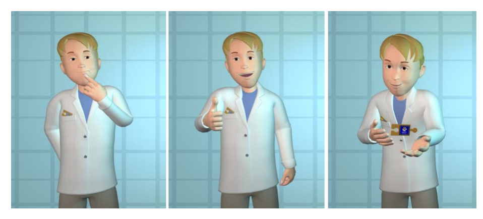
Figure 2. Mike is a 3D cartoon-style pedagogical agent designed to be approachable, supportive, and understanding (among others). These stills are from animations for thinking, giving positive feedback, and displaying a block (magically).

Coach Mike has a total of 46 animations that range from very subtle to emotionally charged (see figure 2). The set includes basic gestures for breathing, basic idling (e.g., hands forward, hands back), natural communication (e.g., hands out and open, nodding, pointing), reactions to visitor programs (e.g., thinking, thumbs up, clapping), conveying empathy (e.g., head scratching, leaning), and showing blocks. We note that we decided to have blocks magically appear, hover for several seconds, then disappear with Coach Mike behaving as if he were a magician (the right-most image of figure 2 attempts to convey this idea). Other animations include one for flexing his muscles, knocking on the glass, looking all around, and raising his arms to signal a touchdown (as in American football). We have plans to examine the role of these animations in influencing visitor behaviors, attitudes, and interest in Robot Park.