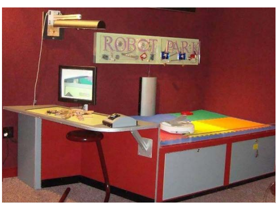
Figure 1. The original Robot Park Exhibit at MoS.

Located in Cahner's Computer Place at the Museum of Science (MoS), Boston. Robot Park is an interactive exhibit where visitors can control an iRobot Create<sup>TM</sup> robot by assembling jigsaw-like blocks into chains of robot commands. It opened in October of 2007, was used by approximately 20,000 people in its first year [5], and continues as a permanent exhibit in the museum (see Figure 1). The primary purpose is to give visitors an opportunity to learn