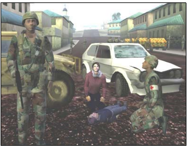
Figure 1: Mission Rehearsal Exercise.

The focus of this paper is a general model of coping, including how it works within a computational framework of appraisal and coping as the central organizing principle for human-like autonomous agents. The framework we discuss has been realized in an implemented system that has been applied to a significant real world virtual human application, the Mission Rehearsal Exercise virtual training environment (See Figure 1.)