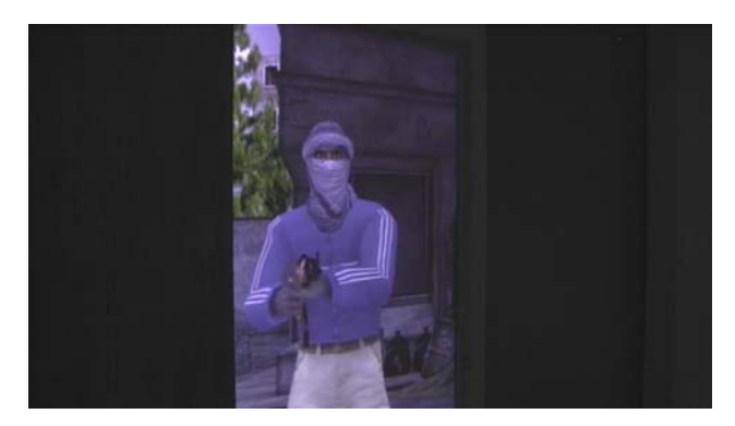
Fig. 4: Virtual insurgent firing toward a real wall in the FlatWorld one room prototype.

Our prototype scenario, completed in August 2006, is seen in Figure 4 and Figure 5. After a virtual insurgent fires rounds into the room, a damage animation is displayed on the opposite wall, creating highly convincing damage effects.