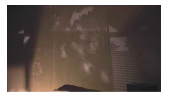
Fig. 5: Realistic computer generated bullet holes and debris appear on the opposite real wall.