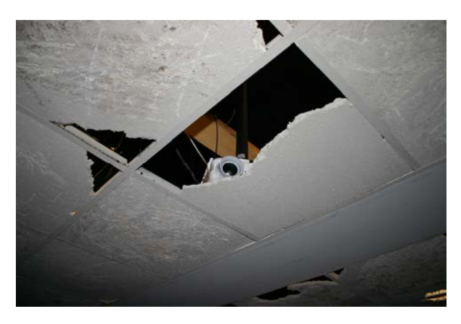
Fig. 2: Projector placed above the ceiling.