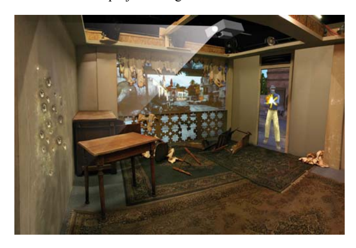
Fig. 1: Conceptual rendering of a virtual insurgent firing virtual bullet holes into a real wall.

In early 2006 we began prototyping the use of frontprojection and projector-camera systems in the FlatWorld wide area mixed reality environment. Our initial demonstration aimed to simulate AK-47 bullet impacts on an unprepared real wall of the FlatWorld environment. The bullets would be fired by a virtual stereoscopic rearprojected insurgent firing into the room (see Fig. 1). To avoid shadows from participants, we planned to place a projector above the ceiling at a sharp angle with respect to the wall projection target (see Fig. 2). Computer vision based geometry correction would be used to compensate for the non ideal projector alignment.