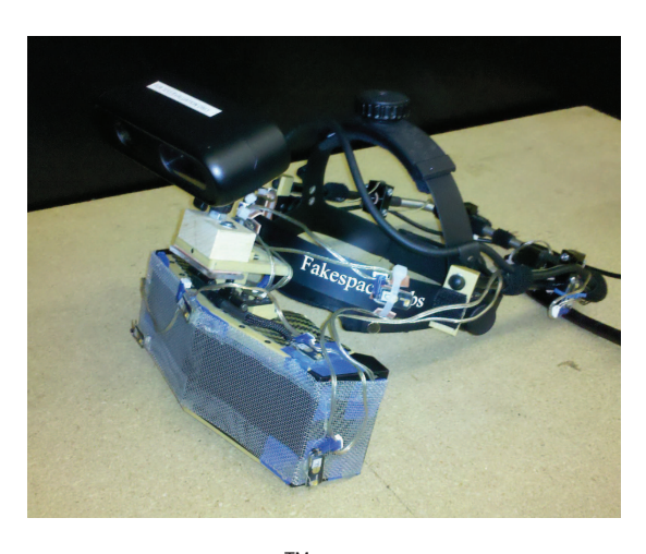
Figure 1: The PrimeSensor<sup>TM</sup>was mounted to the front of the Fakespace Wide 5 head-mounted display. This setup provided real-time depth maps of the real scene as the user's head moved.

IEEE International Symposium on Virtual Reality Innovation 2011 19-20 March, Singapore 978-1-4577-0037-8/11/$26.00 ©2011 IEEE