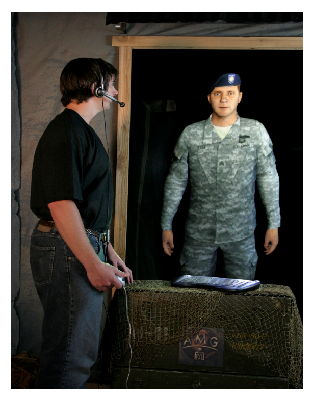
Figure 3: A virtual human character who uses spoken dialogue to understand and answer questions about military careers.

stifle real world immersion, a narrow field of view HMD certainly could limit virtual world immersion.