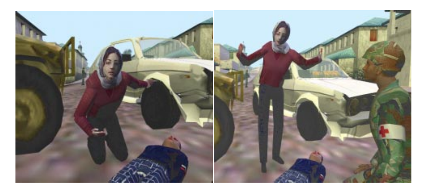
Figure 4: Subdued and angry variants of imploring the lieutenant

tress and anxiety. She transitions back to body focus, which is articulated physically through visible and audible weeping.