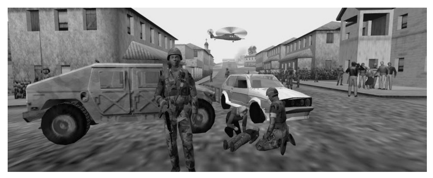
Figure 1: Virtual Bosnian village

perienced a flash of insight in our research that leaves us with intense feelings of joy, only to be crestfallen seconds later by the realization of some crucial flaw. Emotions clearly have a strong influence over our decision-making abilities as well (Damasio 1994; Sloman, 1987).