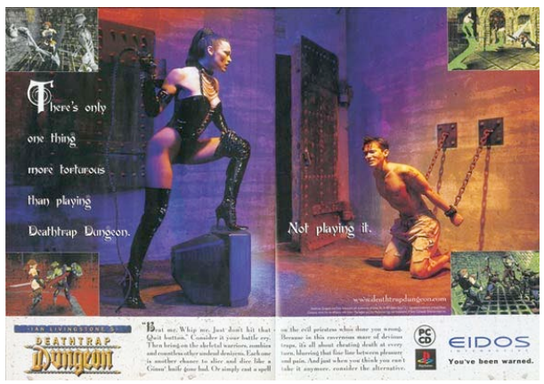
Figure 6: Examples of video magazine game advertisements.

Representation of women is symptomatic of a much larger problem: the games themselves are unwelcoming to those not considered "gamers." Indeed in many respects the digital playground is shut off to "minority" players entirely, whether in terms of game creation, game technologies, or game play, whether merely in terms of creating domains that are exclusively male, or through discriminating or alienating practices of players themselves.