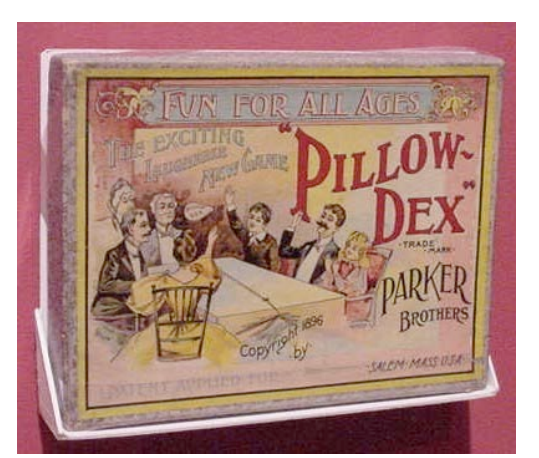
Figure 4: Typical of packaging of the day, Pillow-Dex shows multiple generations enjoying the game.

One of the most intriguing and little-known aspects of the early board game industry was the predominance of women in the production process. The following account, from The Game-Makers , a history of Parker Brothers, sets the stage for what would come to be called "The Pastime Girls," after Pastime Puzzles, the jigsaw division of the company [18]: