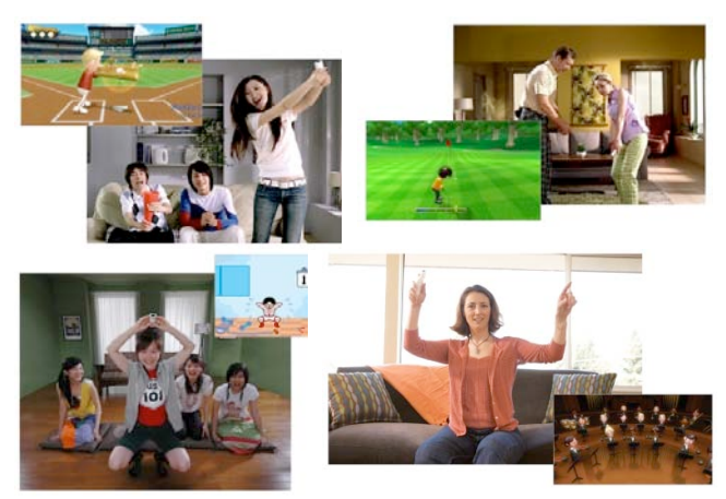
Figure 7: Assorted pre-release ads for the Nintendo Wii.

With the release of games such as Brain Age, Nintendogs and Elektroplankton for the DS, and a whole new interface paradigm along with a range of new game concepts for the Wii, it's clear that Nintendo is moving away from its competitors to open previously untapped markets. The Wii, originally called "Revolution," may in fact truly represent one; it may be as significant as the Model T Ford in creating "videogames for the people." Recent Wii advertising campaigns harkening back to board game packaging of old show a diverse array of players engaging primarily with each other, rather than screenshots showing off graphics, as is the common practice with other systems. (Figure 7) Nintendo, once the undisputed giant of the game industry, has turned its back seat position in the Hegemony of Play into an asset. Rather than racing to create the fanciest graphics with the same old game mechanics, Nintendo has bet on new audiences and accessible game play, cultivating an audience of girls, women, adults and Baby Boomers, in other words, everyone except the "gamer" demographic described above.