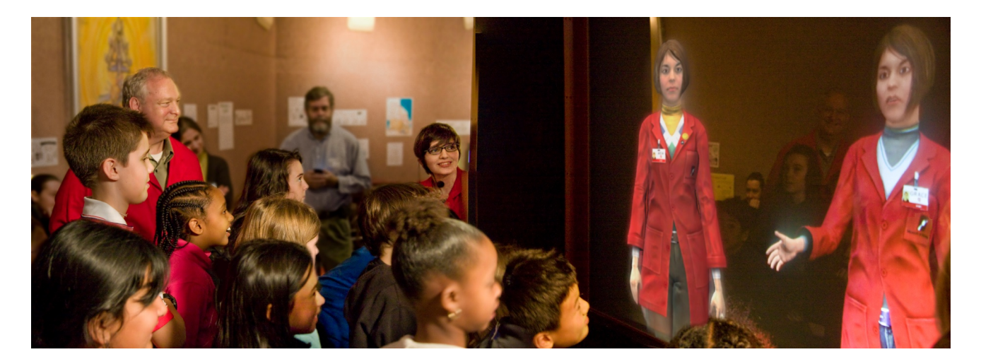
Figure 1: Visitors talking to the Twins at the Museum of Science. Picture from Swartout et al. (2010), Figure 6, page 297.

Speech recognition (2) was performed by the SONIC toolkit (Pellom and Hacioğlu, 2001/2005) until December 2010, and thereafter by OtoSense, a recognition engine that is currently being developed by USC; using OtoSense allowed appropriate customization of the speech processing front-end for the needs of the setup at the museum. Natural language understanding (3) and dialogue management (4) are integrated in a single component, NPCEditor (Leuski and Traum, 2010), a text classification system that drives virtual characters and is freely available for research