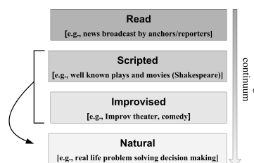
Figure 1: Acting continuum: From fully predetermined to fully undetermined (Busso and Narayanan, 2008)

The significance of studying creativity in theater performance is that improvisation is a form of real-time dynamic problem solving (Mendonca and Wallace, 2007). Improvisation is a creative group performance where actors collaborate and coordinate in real time to create a coherent viewing experience (Johnstone, 1981). Improvisation may include diverse methodologies with variable levels of rules, constraints and prior knowledge, concerning the script and the actor's activities. Active Analysis, introduced by Stanislavsky, proposes a goal-driven performance to elicit natural affective behaviors and interaction (Carnicke, 2008), and is the primary acting technique utilized in the database. It provides a systematic way to investigate the creative processes that underlie improvisation in theater. The role of acting has been considered as a viable research methodology for studying human emotions and communication. Theater has been suggested as a model for believable agents; agents that may display emotions, intents and human behavioral qualities (Perlin and A.Goldberg, 1996). Researchers have advocated the use of improvisation as a tool for eliciting naturalistic affective behavior for studying