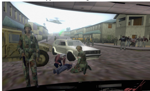
Figure 1: The Mission Rehearsal Exercise System, showing, from the left, the platoon sergeant, the injured boy and his mother, a medic, and a crowd.